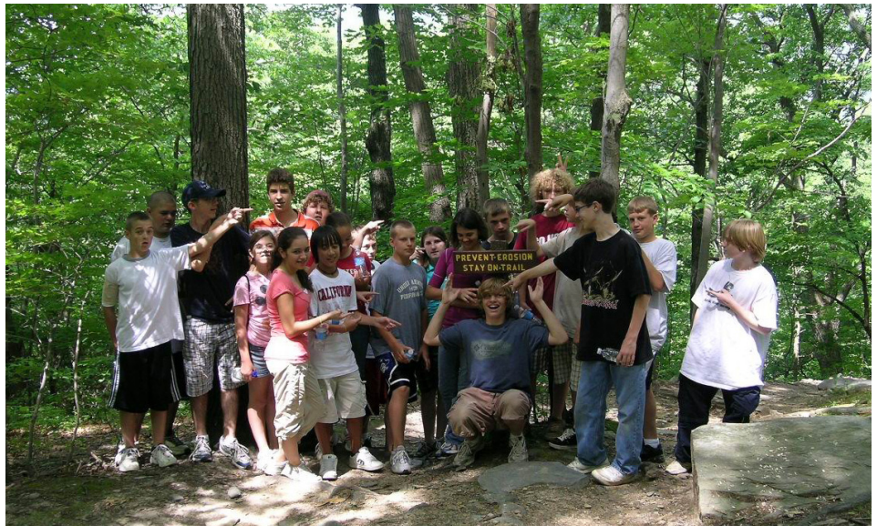
Students from Harpers Ferry Middle School participate in a Tiger on the Trail Hike.

Due to the expansion of the program, additional hike leaders are needed. As a volunteer you can make a difference