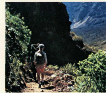
Backpackers hike down into the crater on Halemau Trail for a few days of camping.