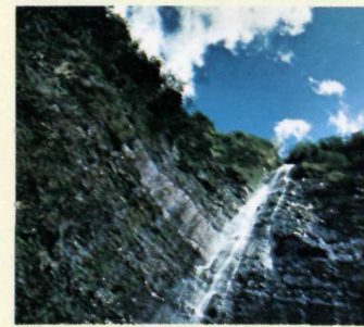
Like a slender, white veil, Waimoku Falls tumbles down from high above the forest.