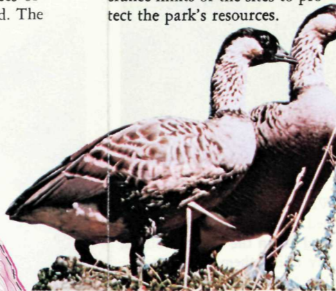
The nene, or native Hawaiian goose, is the State bird.

Check before diving or jumping. In some places there are submerged ledges near the pool's edge.