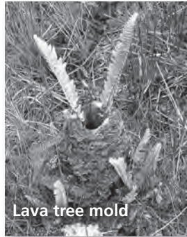
Lava tree mold

Experience lava landscapes from the 1969–1974 Mauna Ulu flows. Walk by lava trees and climb 210 ft / 64 m to the top of a forested cinder cone, Pu'u Huluhulu (hairy hill). View Mauna Ulu's immense steaming shield, which is similar to the now active Pu'u 'Ō'ō cone in the distance.