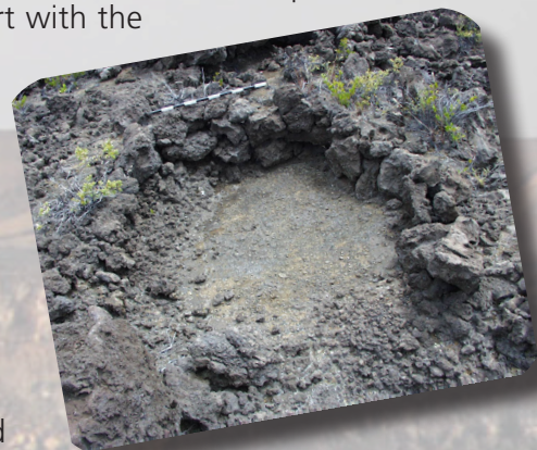
Typical structure found in the Ka'ū Desert.