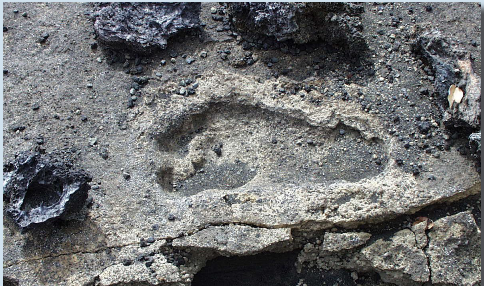
Closeup of typical footprint impression in the Ka`u Desert.