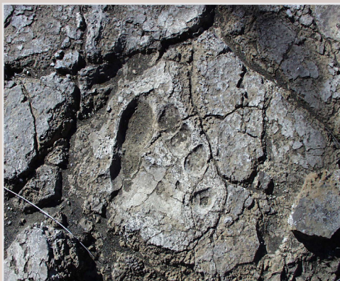
Closeup of toe impressions in the desert.

The archeological site known as "Footprints" is located in the district of Ka'ū, within the ahupua'a (traditional land unit) of Kapāpala. The Ka'ū Desert