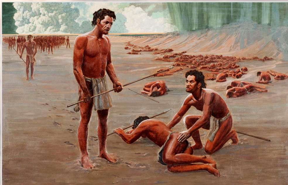
Depiction of the death of the army of Chief Keōua at Kīlauea.

When geologists discovered the footprint impressions in the Ka'ū Desert in 1921, they immediately attributed the prints to Keōua and his warriors. The story of Keōua was well known, having been told to missionaries by local Hawaiians as early as 1823. It was assumed that the footprints must belong to the warriors of Keōua because geologically it fit within the right time-frame. When the site was placed on the National Register of Historic Places in 1974, the nomination referred to Keōua and his warriors as the source of the footprints. No detailed study of the footprints or the area of ash deposit, however, had ever been made. Informal studies of the site began in the early 1990's.