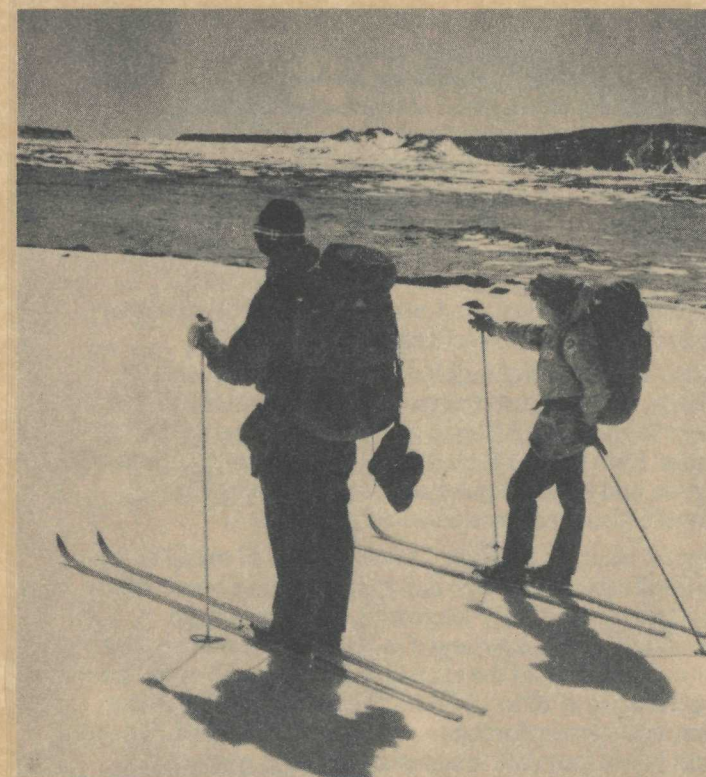
Mauna Loa winter landscape