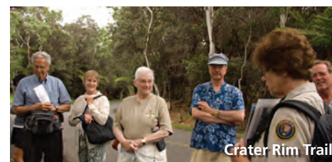
Crater Rim Trail

Other daily activities, are posted at Kīlauea Visitor Center, Jaggar Museum, and Volcano House hotel by 9:15 daily.