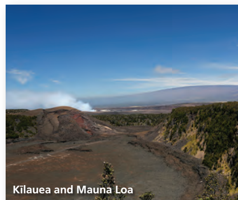
Kīlauea and Mauna Loa