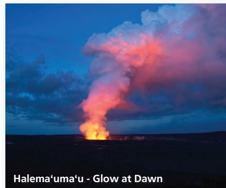
Halema'uma'u - Glow at Dawn