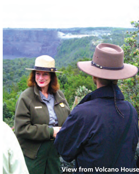
View from Volcano House

Rangers and volunteers present a wide variety of interpretive programs throughout the year. All programs are free and open to the public. See page 6 for program options.