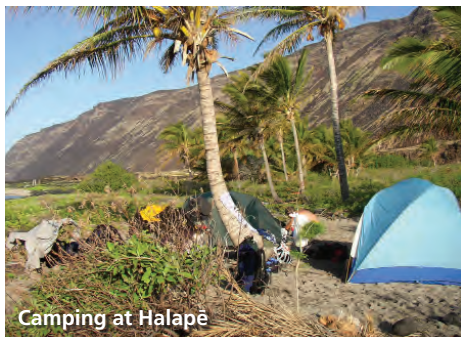
Camping at Halapē

Located off Hilina Pali Road at 3,200 feet (975 m), there are eight walk-in campsites with picnic tables. There is an accessible vault toilet; however, no water is available and campfires are not permitted. Use fueled camping stoves only. This campground is subject to closure when the area is dry and during times of high fire danger. No dogs or pets are allowed at this campground to protect endangered nēnē.