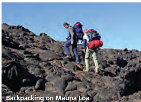
Backpacking on Mauna Loa