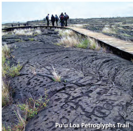
Pu'u Loa Petroglyphs Trail