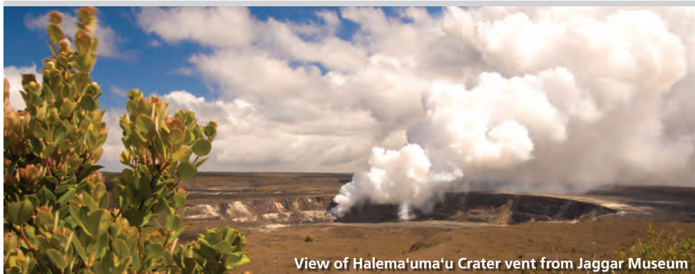
View of Halema'uma'u Crater vent from Jaggar Museum