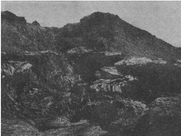
FIG. 3.—A view looking north into the gash of the second largest cone of 1916, situated a little south of the head of flow. Its character as a double semicone, built of ejected products, and the channel of outflow from the gash are shown. This cone is about 70 feet high.

in height and from 50 to 200, or more, feet in the length of the greater diameter, built of pumice, cinders, and spatter outfall—these are also primary sources of flowing streams—with many smaller cones and mouths intervening. The resemblances of these cones and fissures, and their interrelationships, to features in Iceland—especially along the great Laki fissure—as described by Geikie 1 and those from whom he drew, and as exhibited in the views by Anderson reproduced by him, is very striking indeed; few would