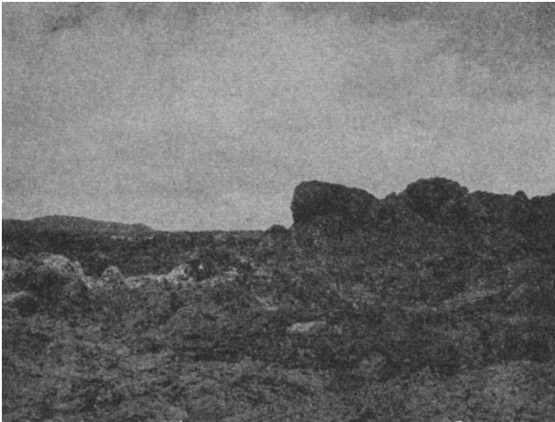
FIG. 4.—A view looking southeast, showing the cone at the head of flow, thin, fresh pahoehoe spread over old pahoehoe and a-a , and the south terminal of the line of solfataras. This cone is from 15 to 20 feet high.

Pahoehoe , which here exhibits various surface textures determined by the interrelationships of different conditions during the progress of flowing, such as the degree of viscosity (dependent in part upon the temperature, the gas content, its state of solution,