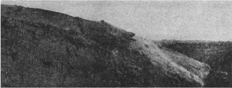
FIG. 2.—A panoramic view looking N.N.E., showing the old red cinder cone riven by new cracks, and the solfatara at the head of the new rift (the figures of the men give scale); and black lava, of 1907, at the base of the cone, which is a little over 100 feet high.

of all proportion, either to the outrush of imprisoned gas from this vent (for gas emission throughout the flow was apparently small in volume and relatively very quiet), or to the momentum-pressure of the outpoured magma. Also, the features of the rifting and their distribution appear to differ from those that should be expected to result from such causes. (Resemblances of this action to fissure-eruption phenomena in Iceland are noted below. See especially Plate VI, c , and Figs. 2 and 3.) Moreover, as just mentioned, great numbers of weak to moderately strong local earthquakes were registered at the observatory 30–35 miles from the source of action, the energy of these increasing even after the cessation of forward movements of the flow, but while the vents at the source