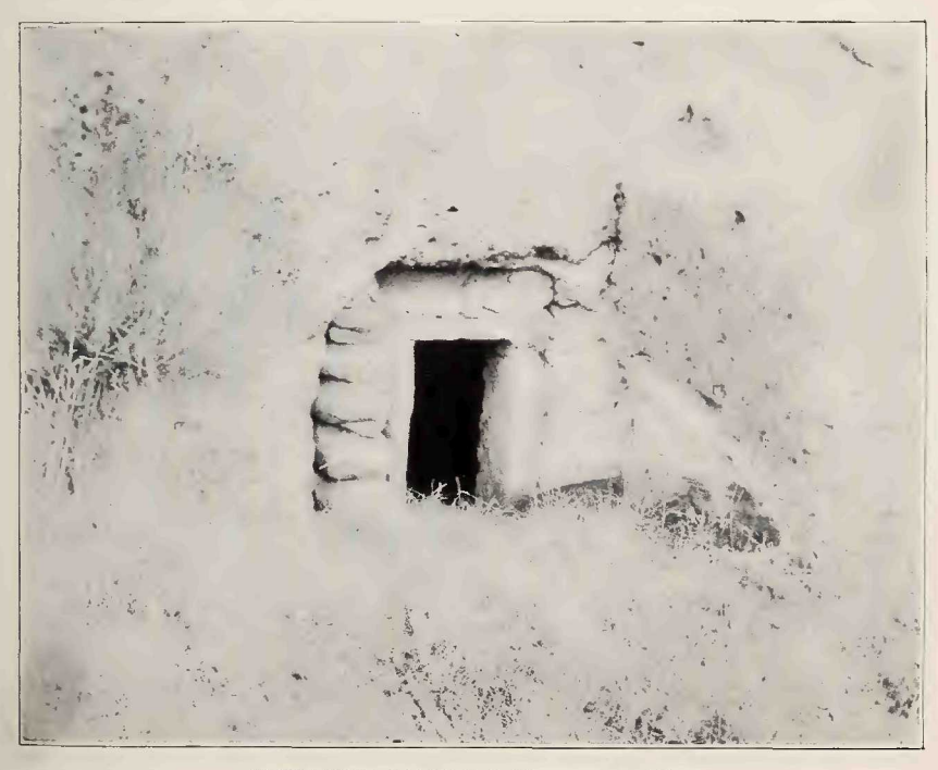
CLIFF HOUSE, PAJARITO PARK, NEW MEXICO.