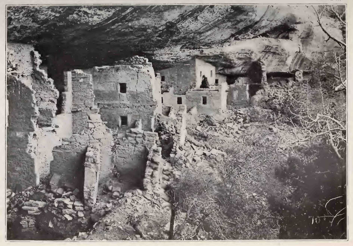
PORTION OF SPRUCE TREE HOUSE, MESA VERDE DISTRICT, COLORADO.