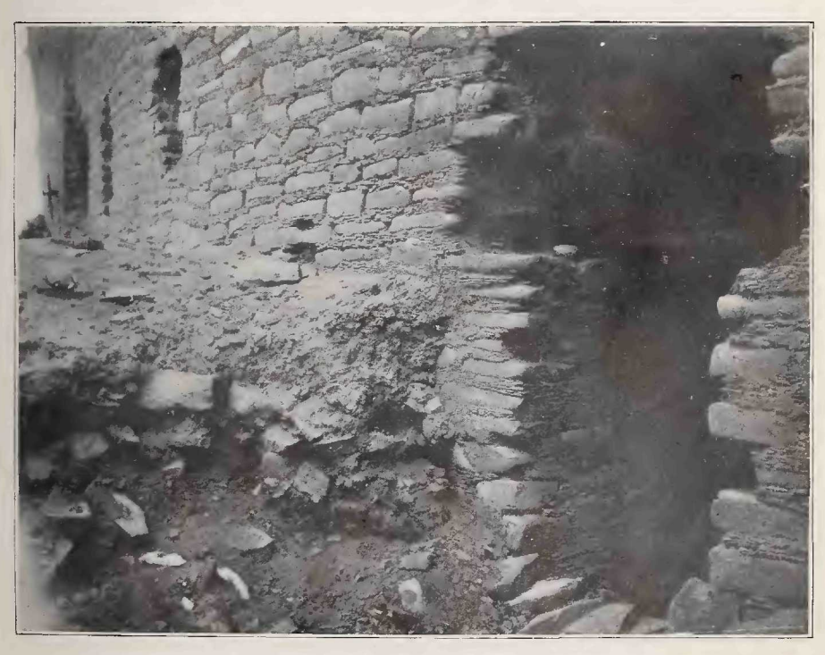
MASONRY OF EXTERIOR WALL, PUEBLO BONITO, CHACO CANYON, NEW MEXICO.