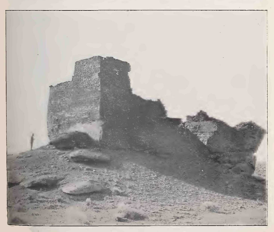
RUINS NEAR BLACK FALLS OF THE LITTLE COLORADO, FLAGSTAFF DISTRICT, ARIZONA