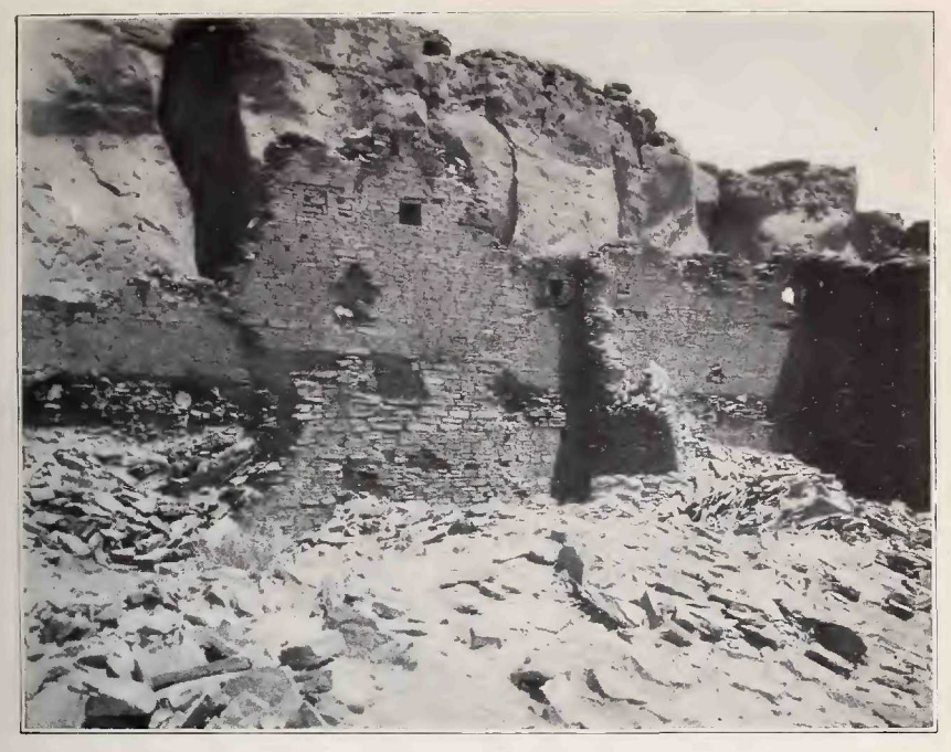
INTERIOR OF HUNGO PAVIE, CHACO CANYON, NEW MEXICO.