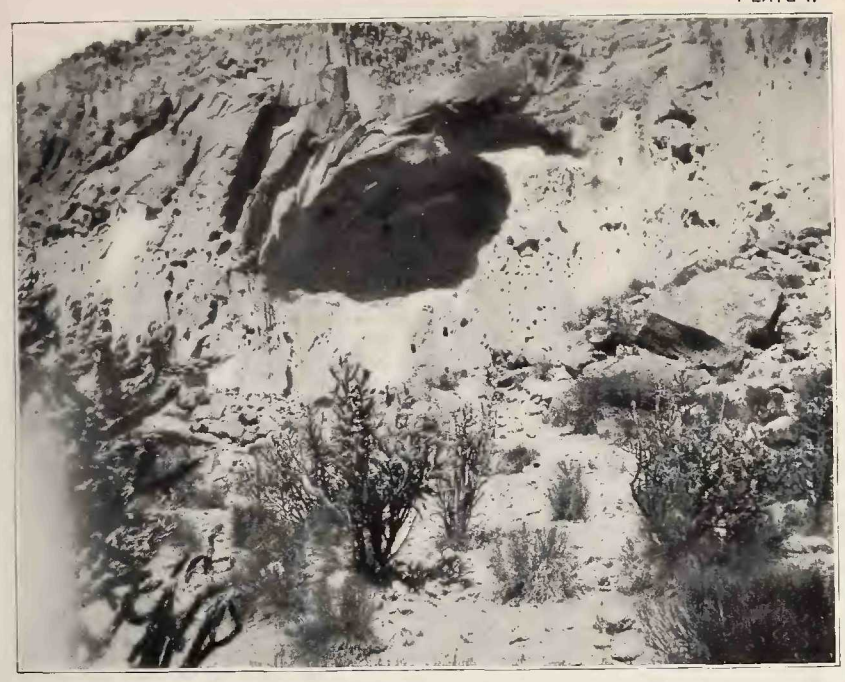
EXTERIOR OF PAINTED CAVE, PAJARITO PARK, NEW MEXICO.