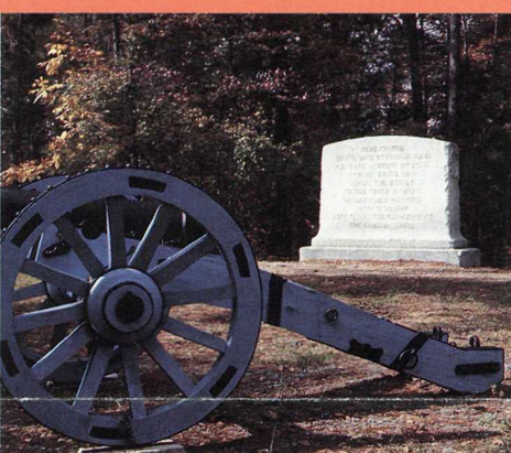
The park's 1918 monument commemorating Horseshoe Bend carries the wrong date for the battle.