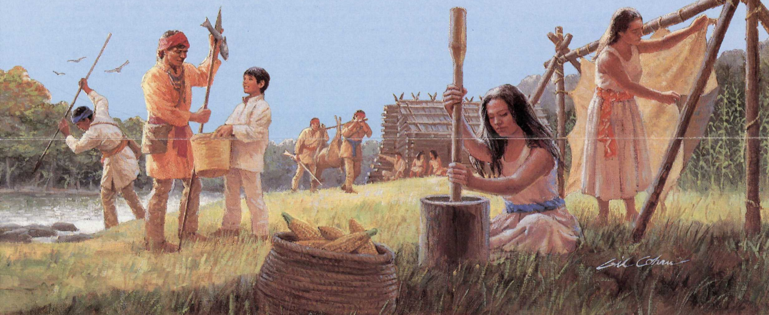
Illustration by Gilbert Cohen.

Upper Creeks, like those who lived in the villages of Newyaucau and Tohopeka, grew their own corn but depended on the richness of the area for fish, game, and other foods.