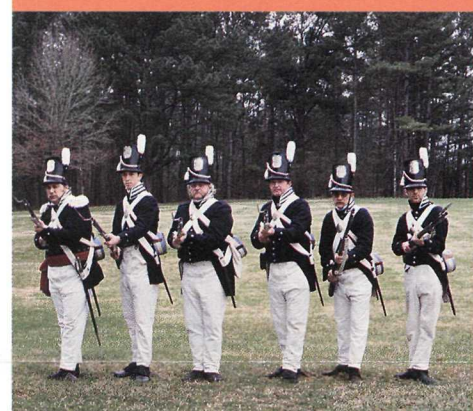
The Thirty-ninth U.S. Infantry: a recreated platoon for living history at the military park.

In 1829, partly as a result of his fame from the battles of Horseshoe Bend and New Orleans, Andrew Jackson was elected President of the United States; a year later he signed the Indian Removal Bill forcing all the tribes east of the Mississippi River to move to Oklahoma, a journey the Cherokees called the "Trail of Tears." The Southeast, cleared of most Indians and free from the threat of foreign intervention, thus became part of the United States and was opened for settlement by whites.