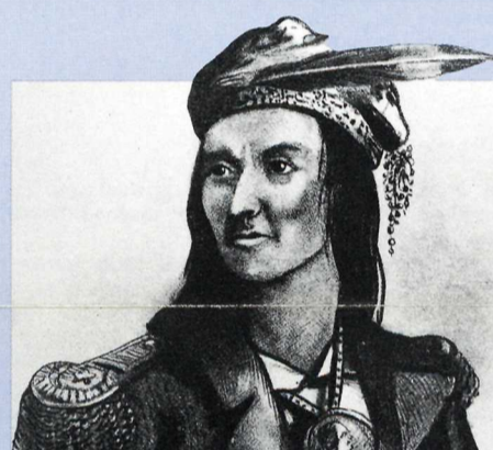
Tecumseh, Shawnee chief and Indian nationalist.

guaranteed American friendship. For nearly two decades, many Creeks followed U.S. Indian Agent Benjamin Hawkins' program for improving their agriculture and living standards, a program designed to foster peaceful relations between Creeks