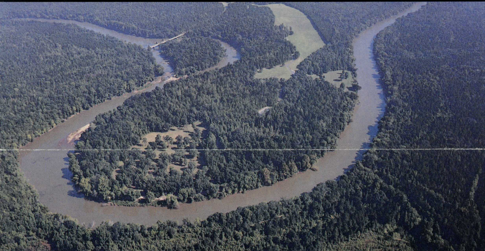
Horseshoe Bend of the Tallapoosa.

Eastern National Park & Monument Association