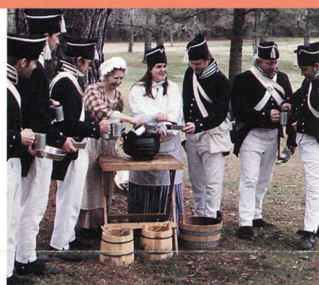
Members of the recreated platoon provide a soldier-and-laundress-life demonstration.