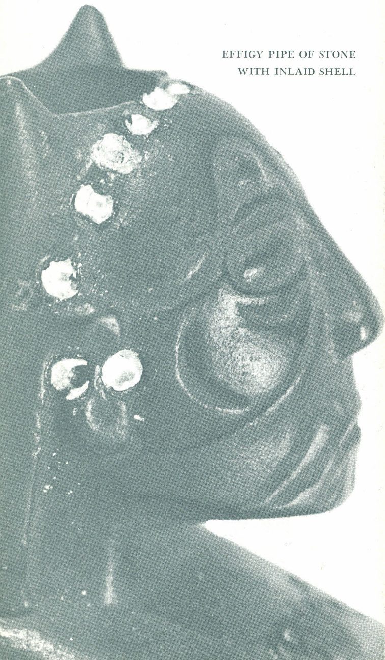
EFFIGY PIPE OF STONE WITH INLAID SHELL

By about 500 B.C. the prehistoric Indians we now call Hopewell had developed a distinctive culture in the Middle West. For perhaps 1,000 years these people flourished; their cultural zenith being here in the Scioto Valley of southern Ohio. But by about A.D. 500 the Hopewell culture had faded. Hundreds of years later European settlers found only deserted burial mounds and ceremonial earthworks to hint at this vanished culture.