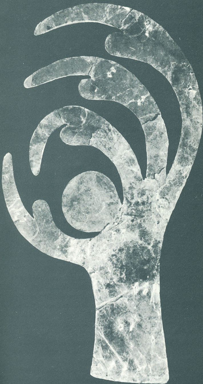
MICA EAGLE CLAW