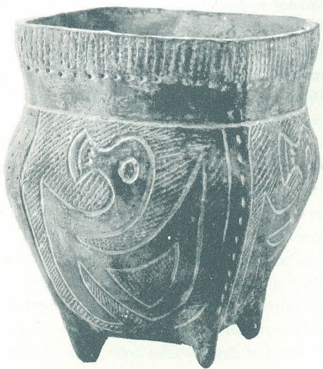
CEREMONIAL POTTERY VESSEL

THE DEPARTMENT OF THE INTERIOR —the Nation's principal natural resource agency—bears a special obligation to assure that our expendable resources are conserved, that our renewable resources are managed to produce optimum benefits, and that all resources contribute to the progress and prosperity of the United States, now and in the future.