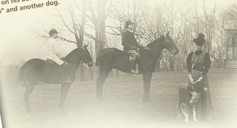
Young FDR rides with his father while his mother holds the hound.