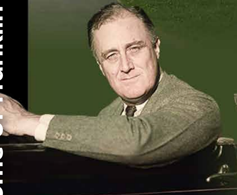
FDR enjoys driving on his property when at home.

1944 Sets up War Refugee Board to help those fleeing Nazi persecution in Europe; radio address announces start of Allied invasion of Europe; offers D-Day prayer for success and protection of soldiers. 1945 Inaugurated to fourth term in White House wartime ceremony; meets Churchill and the USSR’s Joseph Stalin for Yalta Conference to negotiate Europe’s postwar future; dies in Warm Springs, GA, April 12; buried in Rose Garden here; President Truman appoints ER to US delegation to UN.