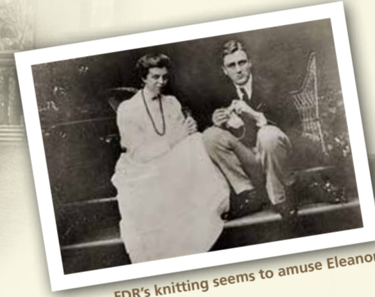
FDR’s knitting seems to amuse Eleanor.