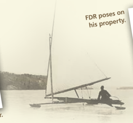
FDR poses on his property.