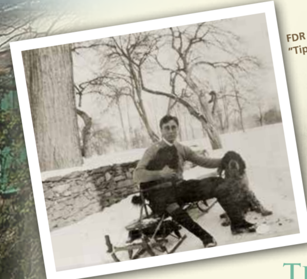
FDR on his bobsled with “Tip” and another dog.