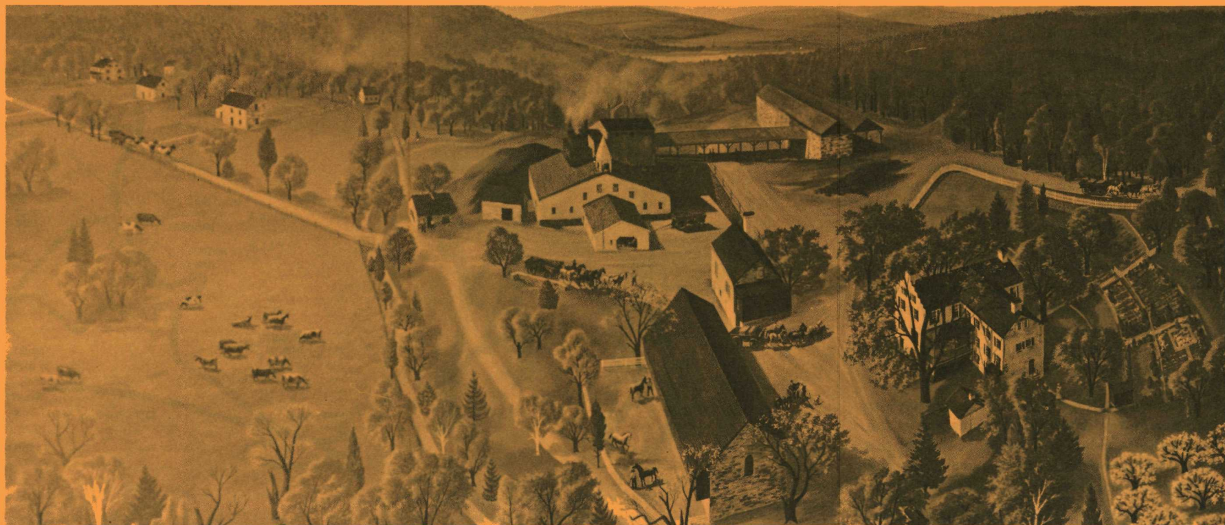
An artist's conception of Hopewell Village in 1840.

National Park Service U.S. DEPARTMENT OF THE INTERIOR