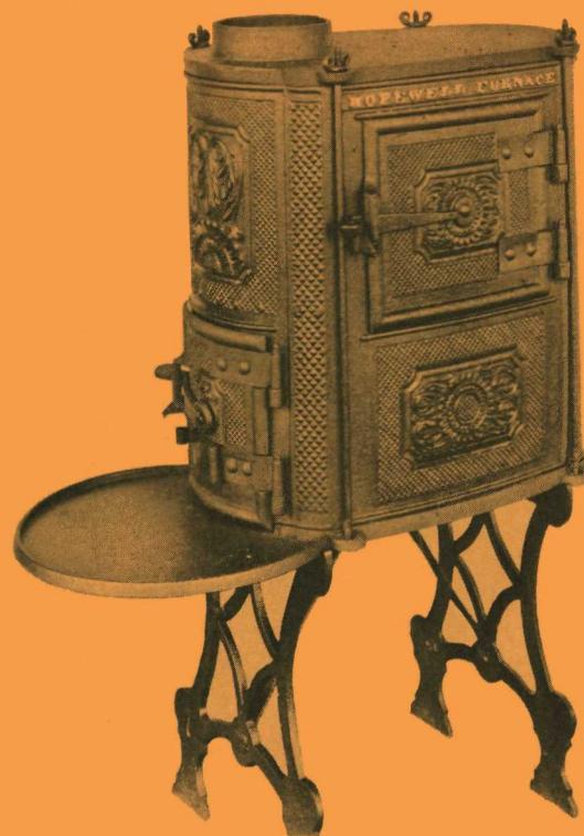
Hopewell cast more than 80,000 stoves in 138 different patterns and types and shipped them as far as Boston. This ten-plate cooking stove was one of the more popular models.

11. Tenant houses. Fronting the old mine road beyond French Creek—whose dammed waters form Hopewell Lake 1,200 feet upstream—are survivors of several dozen company houses where furnace workers lived. The first one is furnished. Other tenant houses were scattered over the 5,000 acres of furnace properties. Most workers, however, lived nearby in their own houses.