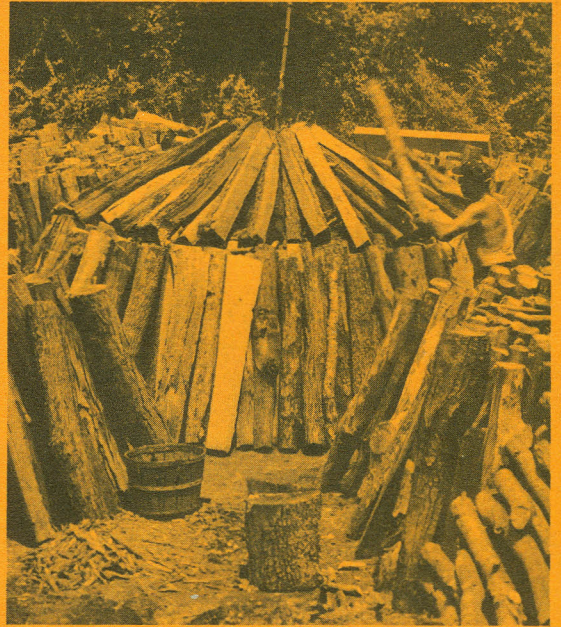
The collier at work.

17. East Head Race and garden. Returning to the visitor center, you cross a race that carried water to help power the water wheel from 1772 to 1853. Flowers, herbs, vegetables, and fruits grew on these terraces. Ruins of a greenhouse are to the right as you go up the steps.