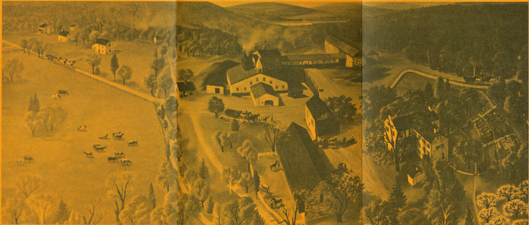
An artist's conception of Hopewell Village in 1840.