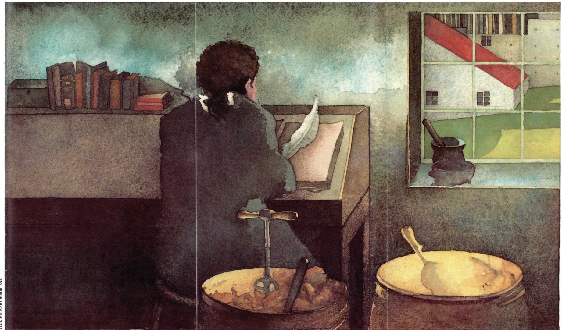
ILLUSTRATED BY BOBBI TULL

PLEASE DO NOT SMOKE IN HISTORIC STRUCTURES