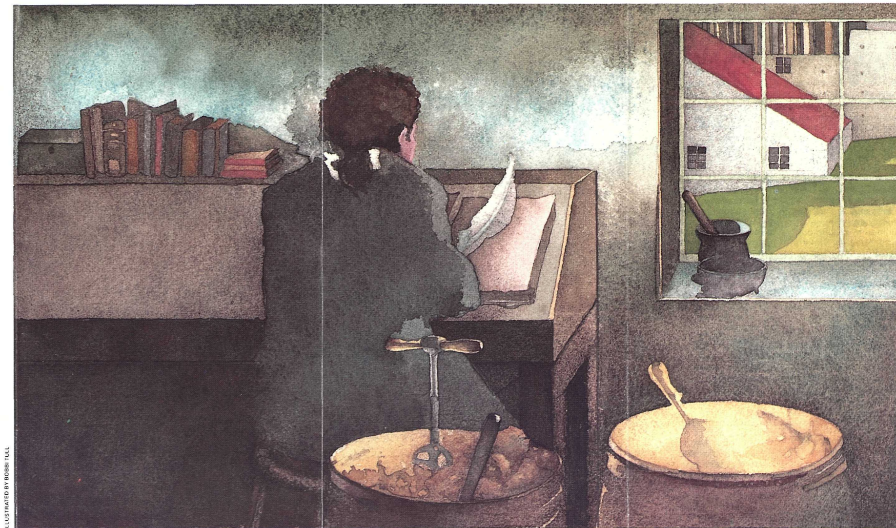
ILLUSTRATED BY BOBBI TULL