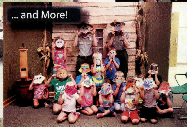
... and More!