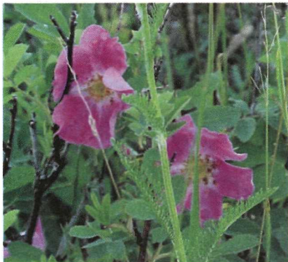
Prairie rose, family Rosaceae