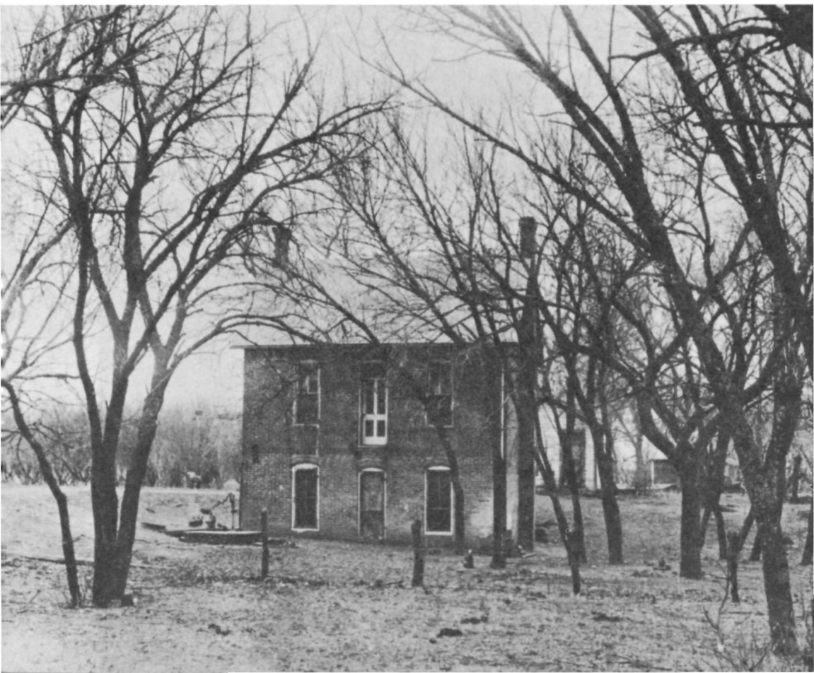
Below—Brick House on the Freeman Homestead Photo circa 1902