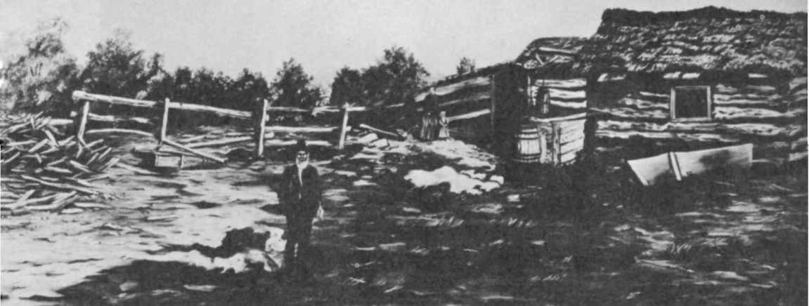
Above—Freeman Homestead Cabin (From painting by Gusta Strohm)