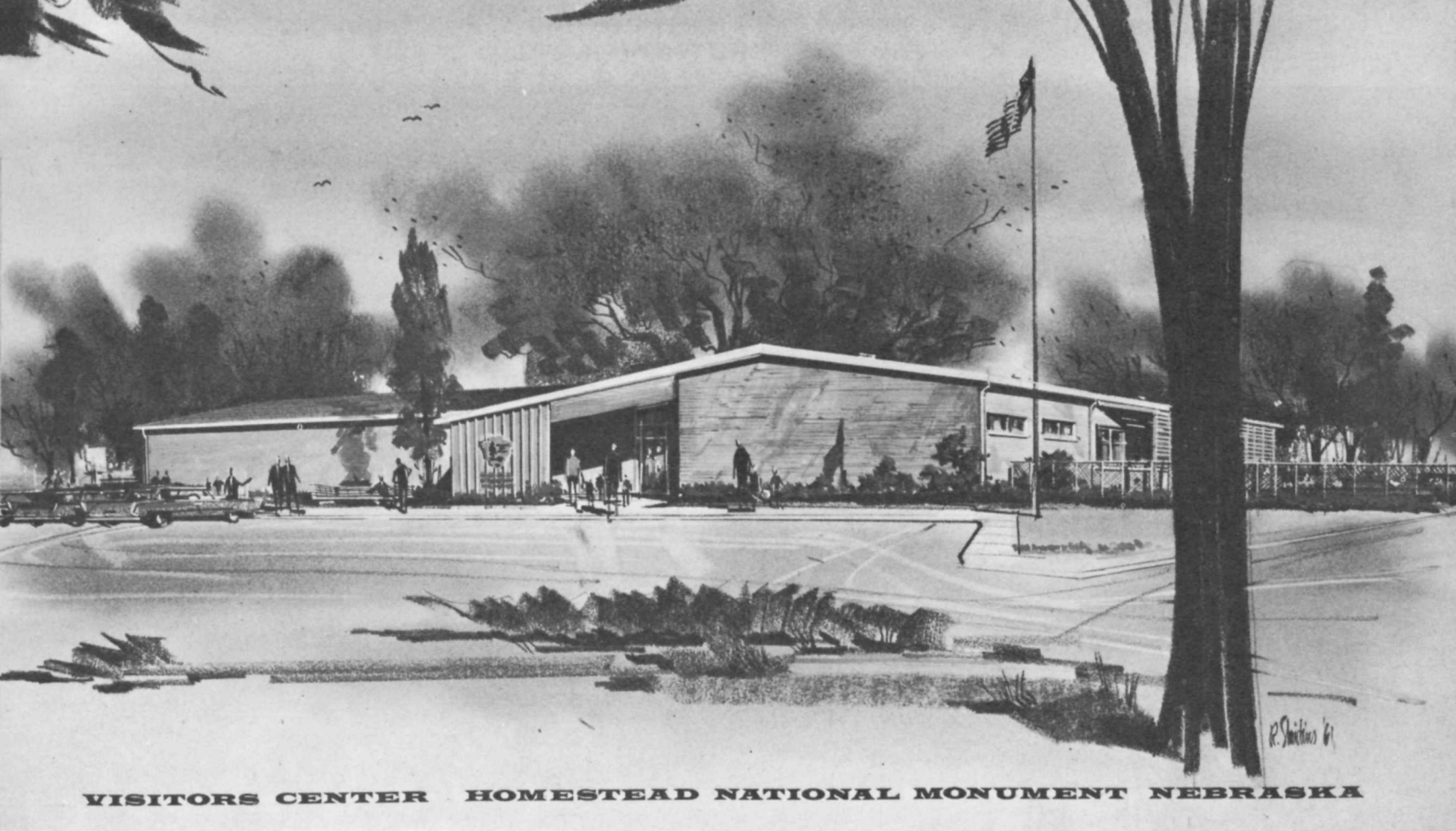
Architect's Sketch