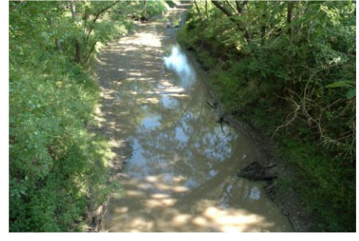
Cub Creek channel

Scientists commonly monitor aquatic invertebrates, the insect larvae and nymphs, worms, isopods and other invertebrates living in creeks, to assess water quality. Many benthic invertebrates reside in the stream substrate for a year or more, exposed to water quality conditions throughout that time. Some species tolerate poor water quality and some species require pristine conditions. Therefore, aquatic invertebrate monitoring provides a sound tool to recognize deterioration of water quality in a stream, just as the canary indicates deterioration of air quality in a coalmine.