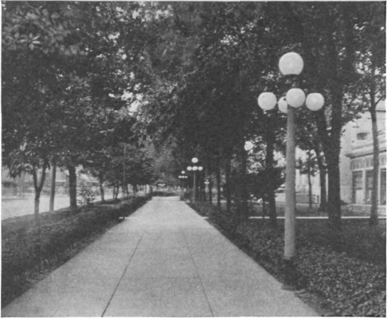
MAGNOLIA PROMENADE ALONG BATHHOUSE ROW.