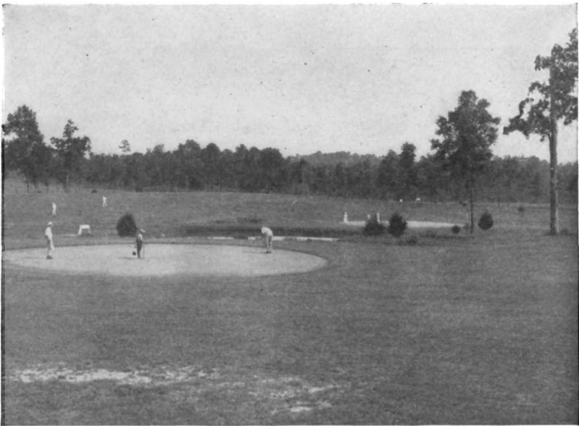
THE HOT SPRINGS GOLF COURSE

One of the recreational features of Hot Springs