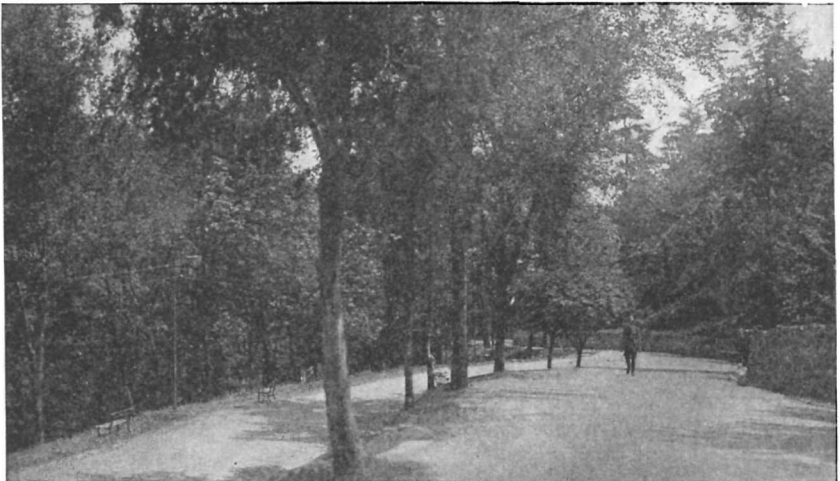
DELIGHTFUL ROADS CLIMB HOT SPRINGS MOUNTAIN.

Hot Springs is also easily reached by automobile over good roads from practically all points in the United States. It is on the direct line of the Bankhead Highway reaching from Washington, D. C., to San Diego, Calif.