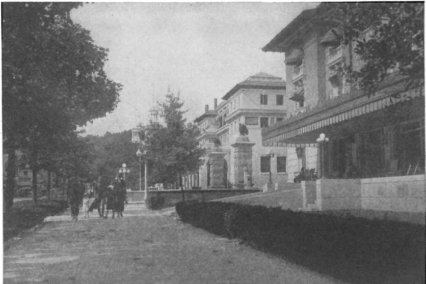
VIEW LOOKING UP BATHHOUSE ROW.

9. Violation of any of the foregoing regulations will, in the discretion of the superintendent, cause the revocation of the privilege of using these roads, and will subject the owner of the automobile to liability for any damage occasioned thereby and to ejection from the park.