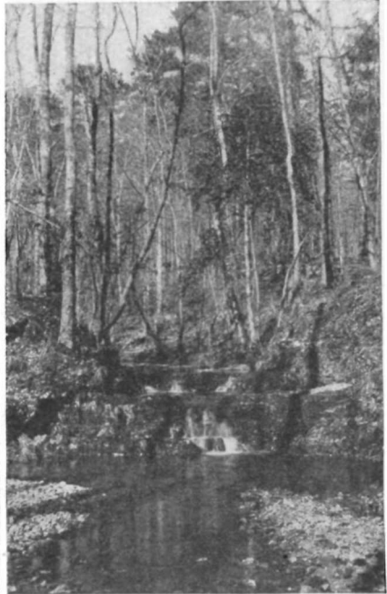
FALLS ON UPPER GULPHA CREEK GULPHA GORGE.