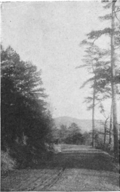
PINES ON NORTH MOUNTAIN.