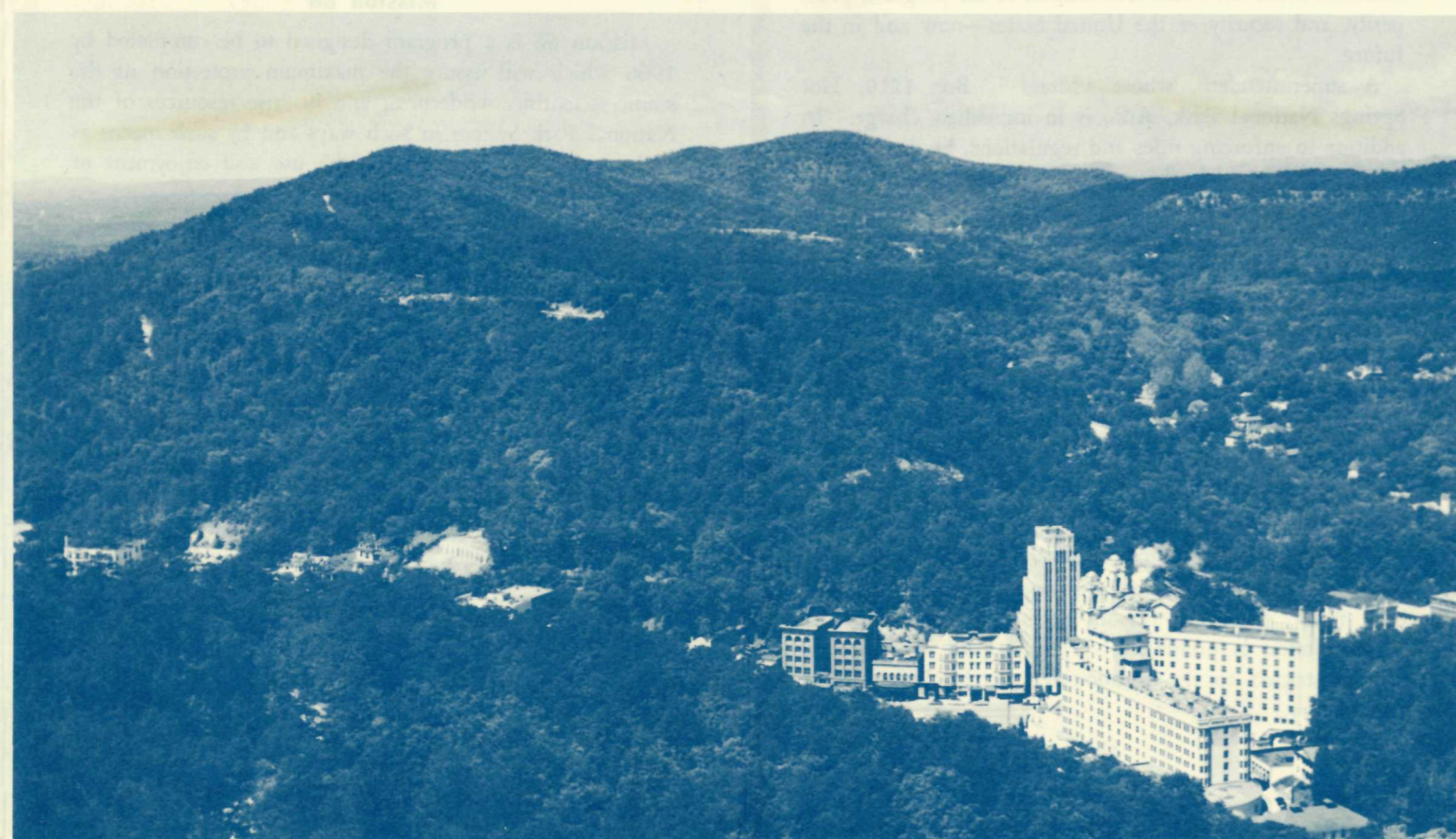
Central Avenue and West Mountain, from the observation tower on Hot Springs Mountain.

According to another theory, the hot springs water has never been at the surface of the earth, but comes from heated rocks of the earth's interior. Such magmatic, or juvenile, water escapes from cooling molten rock and rises to the surface. Other sources of heat that have been suggested to explain the temperature of the water are (1) heat from chemical reactions taking place near the water; (2) heat of friction from rock masses sliding along each other; (3) heat of compression due to overlying rock burden; and (4) heat from radioactive minerals.