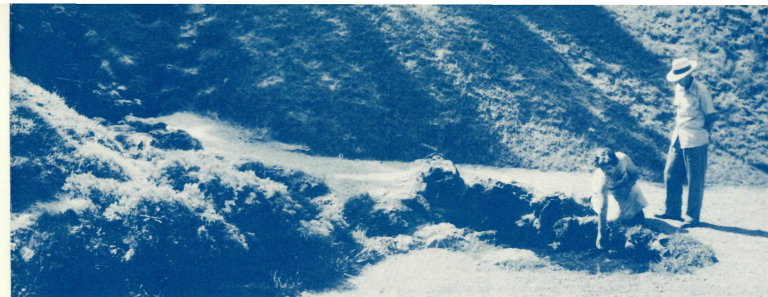
One of the hot springs.

Administration of the National Park by the Federal Government does not extend to the city of Hot Springs, which operates under its own municipal and State laws. City and park authorities cooperate in planning joint programs and in