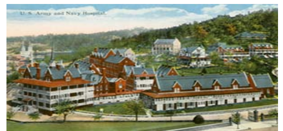
First Army-Navy Hospital and Grounds