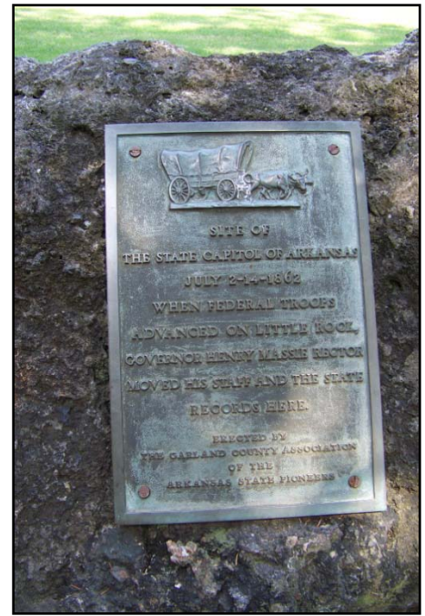
A plaque commemorating Governor Rector's Bathhouse Row capital is on a tufa rock near the Superior Bathhouse.

The hot springs had been set aside for federal property, but oversight was non-existent until the 1870s. In fact a Confederate capital briefly occupied Bathhouse Row under then-governor, and staunch Confederate, Henry M. Rector. When Little Rock seemed in danger of falling to the Union, in mid-1862, he came home to the bathhouse and “kitchen” he owned here. By wagon train from Dardanelle, he brought 7 to 9 tons of state archives, funds, and other supplies out of Little Rock. His sudden departure caught the Capital City off-guard, although his popularity had waned for other reasons since his election in 1860. Soon after returning to Little Rock, Rector was voted out of office.