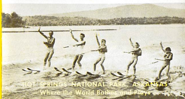
HOT SPRINGS NATIONAL PARK, ARKANSAS Where the World Bathes and Plays