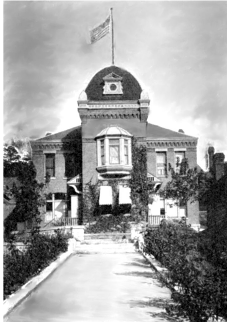
Figure 3: The Government Free Bathhouse in 1896, situated slightly behind the other grand structures on Bathhouse Row.

but now the water was confined to buildings and pipes. Never again would visitors be able to take their place in "a few inches of hot water and a foot or more of hot mud." 33