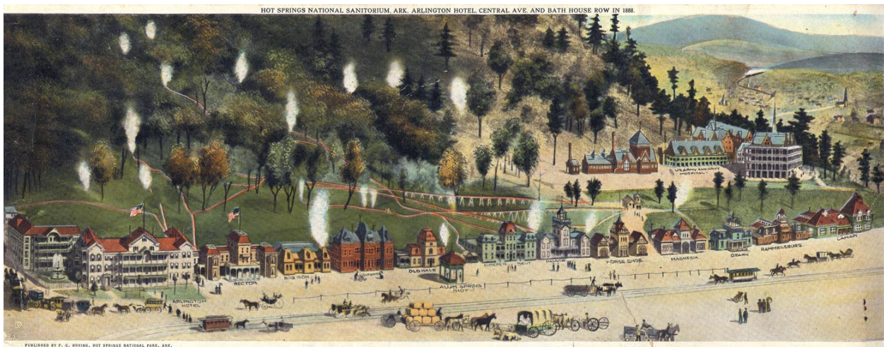
Figure 4: In this illustrated 1888 panorama of Hot Springs Reservation, the grand bathhouses stand in a row lining the street. The Government Free Bathhouse is situated just behind them on the right side of the image, the tiny building (here exaggeratedly small) between Bathhouse Row and the U.S. Army and Navy Hospital. Pipes and troughs carrying water to the bathhouses are also illustrated, and the clouds of steam represent places where naturally occurring springs once emerged from the ground but are now covered.

Over time, changing beliefs about public health and a new focus on sanitation meant that patrons worried less about their proximity to nature. 36 For the most part, those who could afford to had moved to the pay-bathhouses. 37 In 1911, access to free baths in Hot Springs was restricted further. To curb overuse of the free bathhouse and give in to pressure from paid bathhouse owners who thought potential customers might be abusing the system, Congress passed a law demanding that those who wanted free baths swear an oath that they could not afford to pay. If they were caught lying about their financial status, they faced a misdemeanor charge and a twenty-five-dollar fine or six days in jail. 38 In other words, the government still felt that the waters should be available to everyone, but with technology that restricted where people could access the water, they drew tighter boundaries around who could use the waters for free.