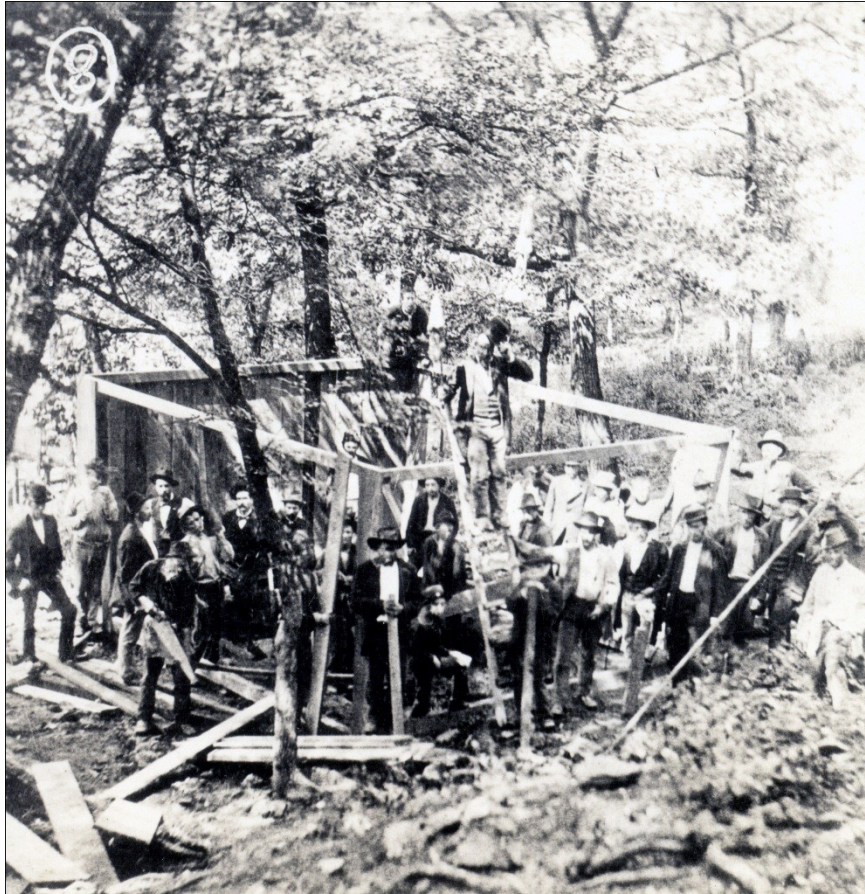
Figure 2. Protestors reconstruct a structure near Ral Hole in 1878 following General B. F. Kelley's orders to have all structures removed.

The result was a protracted conflict, as indigent bathers refused to leave, staged protests, and made bathhouse owners fear that their buildings and lives were in danger. 25 One newspaper reported that a “mob surrounded the Grand Central Hotel and howled for Kelly. . . . Threats have been made that they will burn down the town and lay the bath houses in ashes,” although in a letter to the editor, another person wrote that “although much regret was manifested, I heard no threats whatsoever.” 26 At Kelley’s request, an infantry division arrived in Hot Springs to bring order. 27