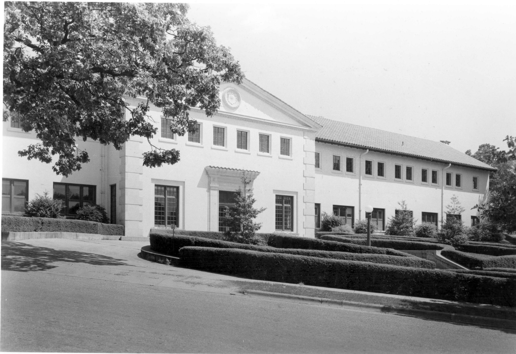
Figure 5: The last iteration of the Government Free Bathhouse, constructed off of Hot Springs Mountain and away from Bathhouse Row in 1921.

increasingly grand structures on Bathhouse Row, seemed like an aberration. In 1916, the federal government created the National Park Service, and Hot Springs Reservation came under its purview. As new officials took a more active role in management, Hot Springs leaders sought to improve on their resort-town dream. They pushed for more landscaping, improved walking paths, and other aesthetic improvements. Among these requests was the removal of the free bathhouse. 42