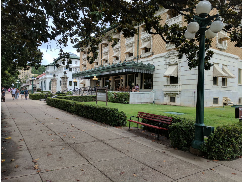
Figure 6: A 2017 photograph on Bathhouse Row at Hot Springs National Park. The bathhouse in the foreground now houses the park's visitor center.