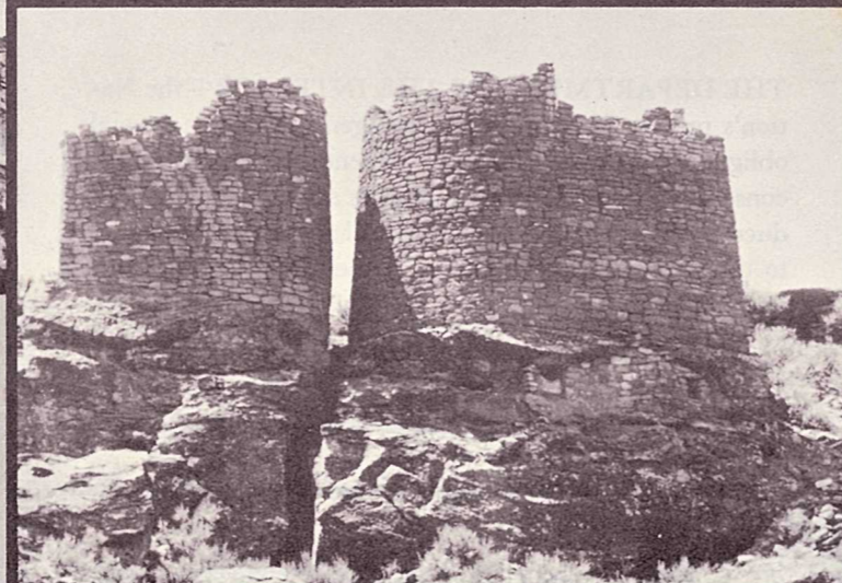
(Upper right) The Square Tower, Square Tower Group, Utah