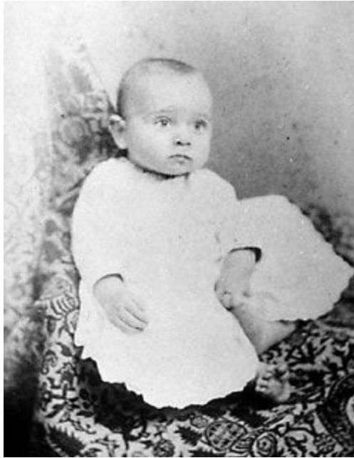
Figure 5: Harry S Truman, c.1884.

I wouldn't think much of a man that tried to deny the people and the town where he grew up. I've told you. You must always keep in mind who you are and where you come from. A man who can't do that at all times is in trouble where I'm concerned. I wouldn't have anything to do with him. 9