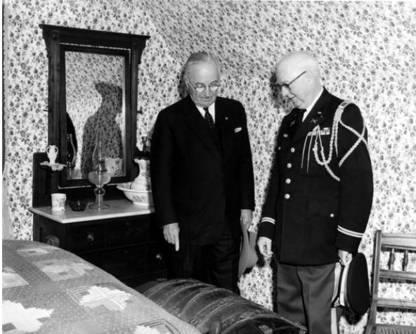
Figure 3: Harry S. Truman at the birthplace on April 19, 1959.