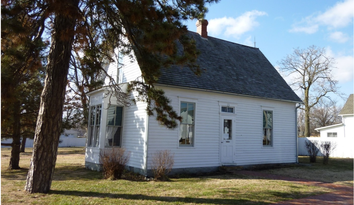
Figure 2: Harry S Truman Birthplace State Historic Site, Lamar, Missouri (February 2010).

Although there is little evidence that the adult Harry Truman held nostalgic feelings for his birthplace, he seems to have recognized its symbolic value. Politicians are traditionally, if somewhat strategically, nostalgic about their birthplaces, often returning there during election campaigns. Such a visit, obviously, reinforces the candidate's roots, his appreciation for simpler times and honest people. The visit reminds voters that the candidate was, in fact, born and raised somewhere, just like everybody else, and was not manufactured by political strategists. In fact, it seems that Truman did not return to his hometown until he was well into adulthood, specifically in 1934 during his successful run for the U.S. Senate.