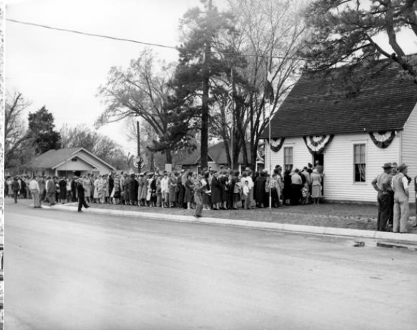
Figure 4: Line to tour the birthplace at the dedication.