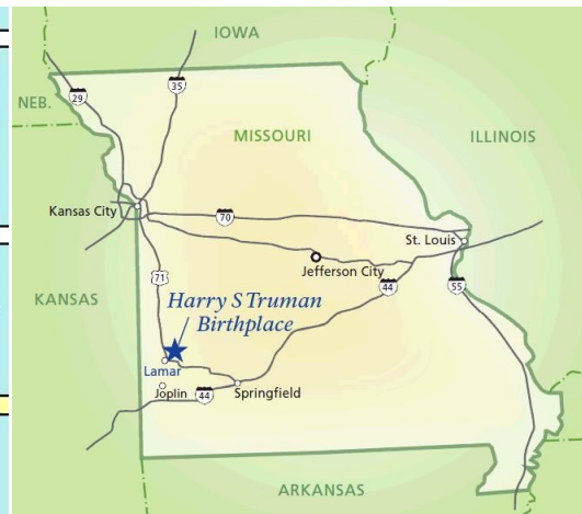
Figure 2: Location of Lamar, Missouri.