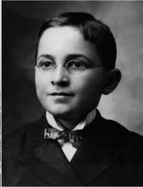
Figure 6: Harry S Truman, 1897.

And, again, he recalled his early years with great fondness: