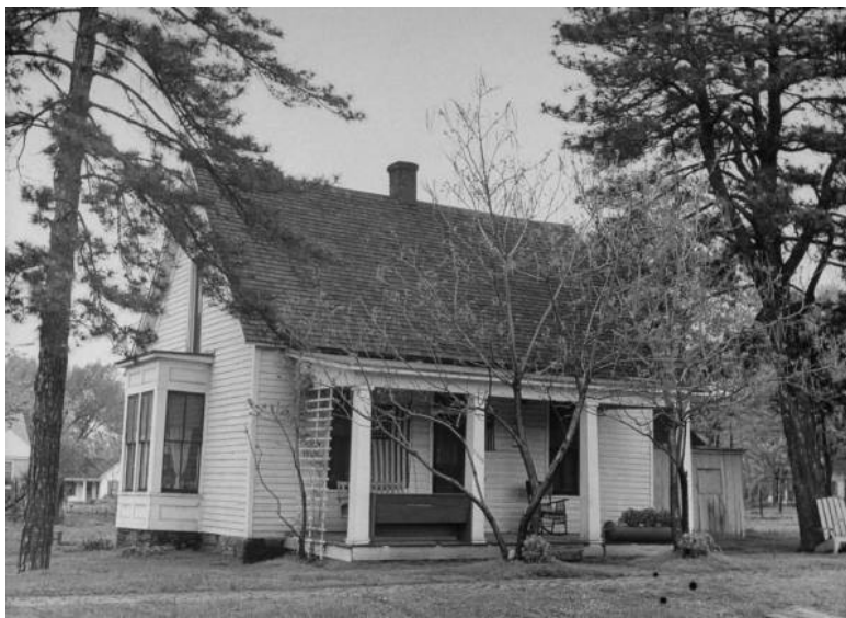
Figure 7: Harry S Truman Birthplace, 1945. The porch was an addition after the Truman family's tenure there; it was removed in the restoration of the site in the late 1950s.

Thus it was to be that Young homeplace where small Harry S. Truman made most of his earliest observations of the world, beginning at age three. . . a household of seldom less than fourteen or fifteen people spanning three generations, all under one roof. 11