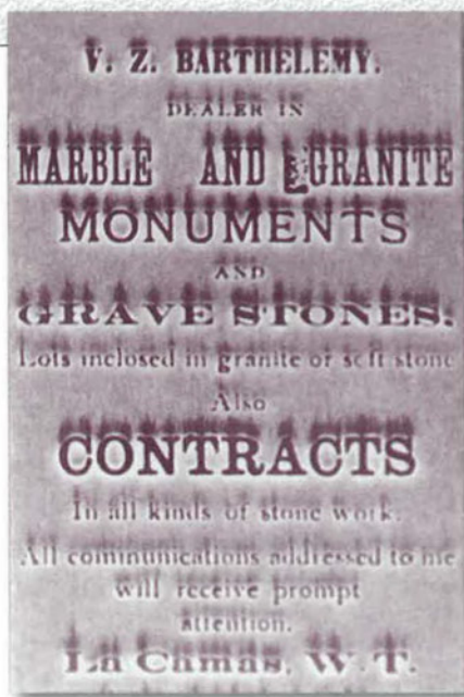
Reproduction of an advertisement placed by V. Z. Barthelemy in early editions of the LaCamas News.

Allison related that these previous researchers generally agreed that the uniformity in maximum elevation of the deposition clearly indicated that the erratics could only have been emplaced as part of a strand line of icebergs floating upon a body of water. This proposed inundation of the Willamette valley was not altogether shocking. In 1871 Thomas Condon, the "Father of Oregon Geology," had postulated just such a submergence based on the elevations of certain stratigraphic features in the Shoalwater [now Willapa] Bay area and fossil beds near the mouth of the Deschutes River in the Columbia River Gorge. Condon theorized that the