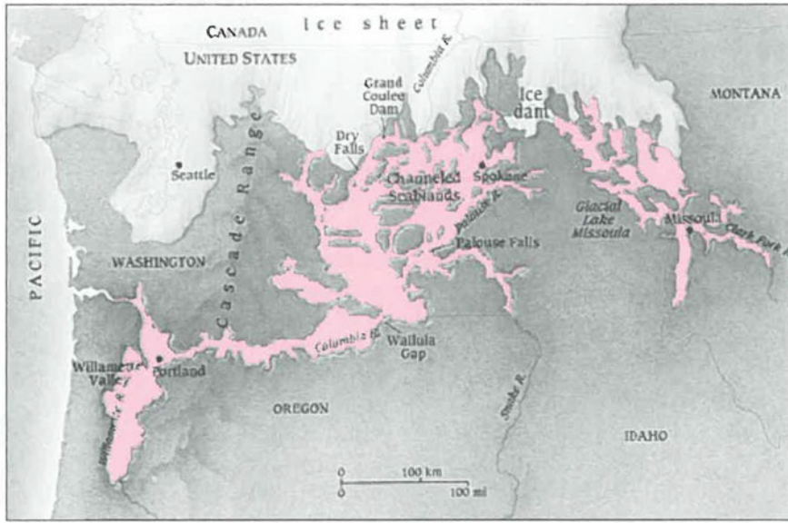
LEFT: This map shows the Cordilleran Ice Sheet, glacial Lake Missoula (dark pink), and the massive area inundated when the ice dam gave way (lighter pink).