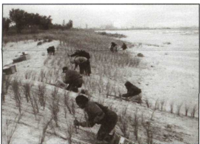
Save the Dunes Conservation Fund volunteers participate in a Marquette Park restoration project.