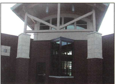
This visitor center is located on the southeast corner of U.S. Highway 20 and Indiana 49.