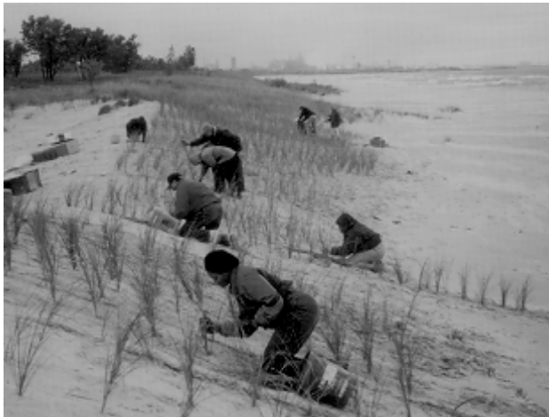
Volunteers for the Save the Dunes Conservation Fund participate in a restoration project at Marquette Park.