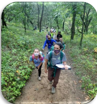
Students are back at Dunes Learning Center for programs!

November 15 was National Philanthropy Day. This year, Dunes Learning Center nominated the Flora Richardson Foundation as the Foundation Philanthropist of the Year for their generous support of Duneland School students. Each year, every 3rd and 4th grader in the district is able to attend a program at Dunes Learning Center. The Philanthropy Day awards ceremony took place outdoors, with representatives from Dunes Learning Center, the Flora Richardson Foundation, and the local Association of Fundraising Professionals. Please check out the video at: Facebook.com/duneslearningcenter