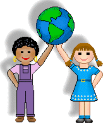
Martin Luther King, Jr. Day

In honor of the holiday, join staff and fellow volunteers in helping to care for your local national park while remembering Dr. Martin Luther King Jr. Wear comfortable clothes; work gloves and equipment will be provided. Meet at the Park Connection Office.