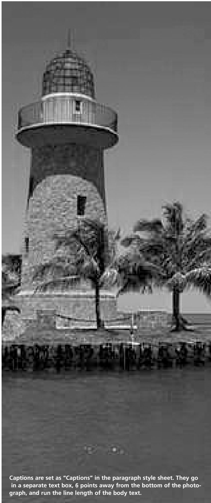
Captions are set as "Captions" in the paragraph style sheet. They go in a separate text box, 6 points away from the bottom of the photograph, and run the line length of the body text.