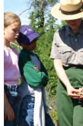
The National Parks: America's Best Idea for Educators

The History of the National Park Service www.nps.gov/history/history/