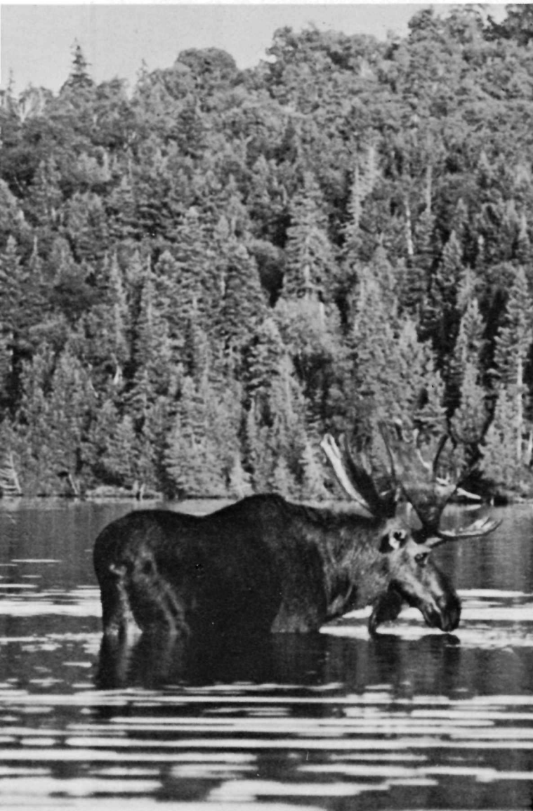
A famous resident in typical pose.

Roman Catholic and Protestant services are held each Sunday at Rock Harbor Lodge.