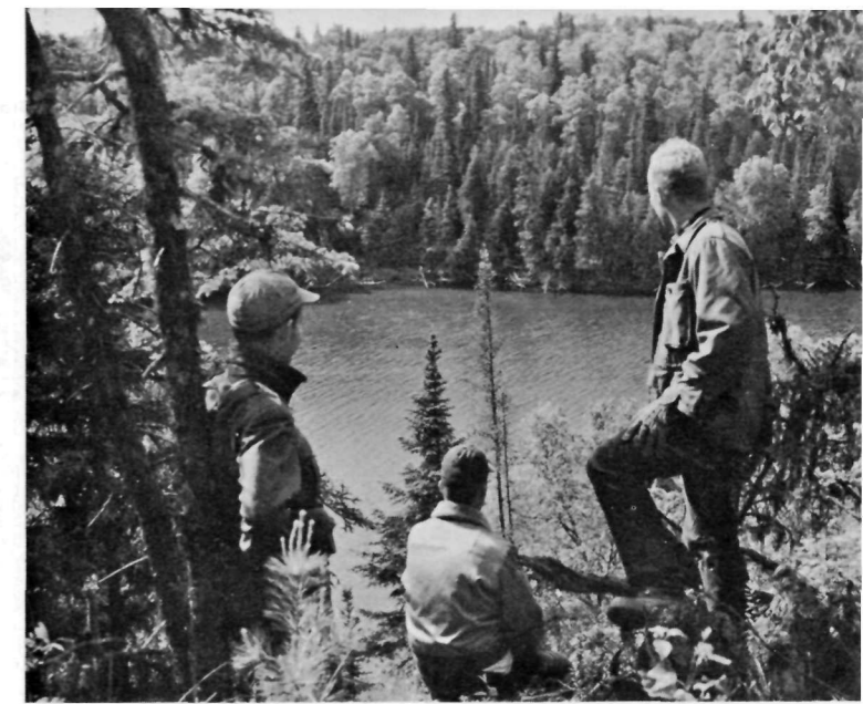
Let's stay awhile.

There are no regular medical services in Isle Royale National Park. Therefore, extreme care must be taken to avoid accidents. Those who knowingly have heart difficulty or some similar ailment should, in their own interest, consult their physicians before planning a visit. Often there are physicians among the guests at the lodges, and their services are always sought in emergencies; but their presence at the right place at the time of emergency is only coincidental. A plane or boat can carry injured or ill persons to Houghton where good medical services and a hospital are available . . . if weather permits .