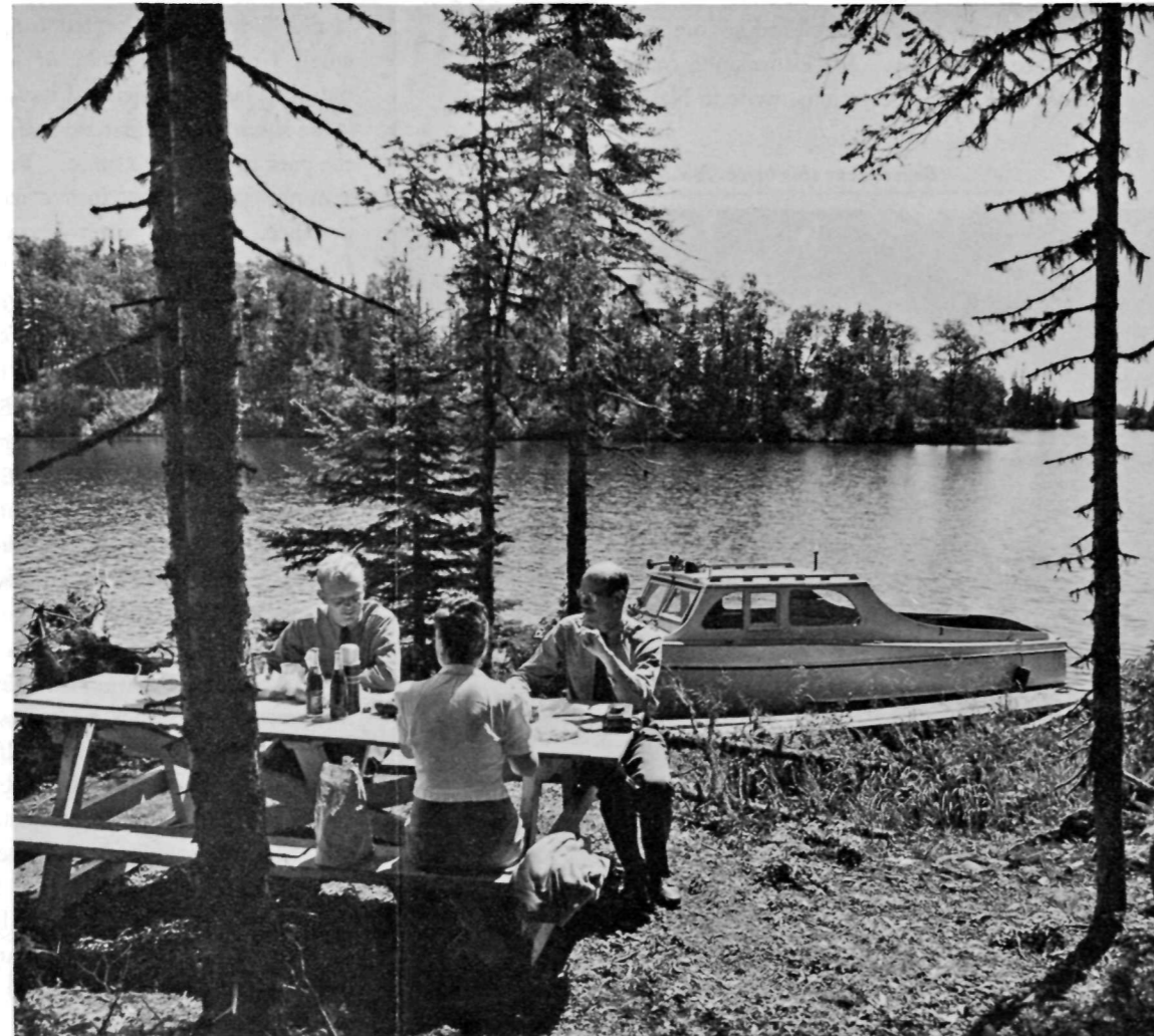
Lunch time in a secluded cove.