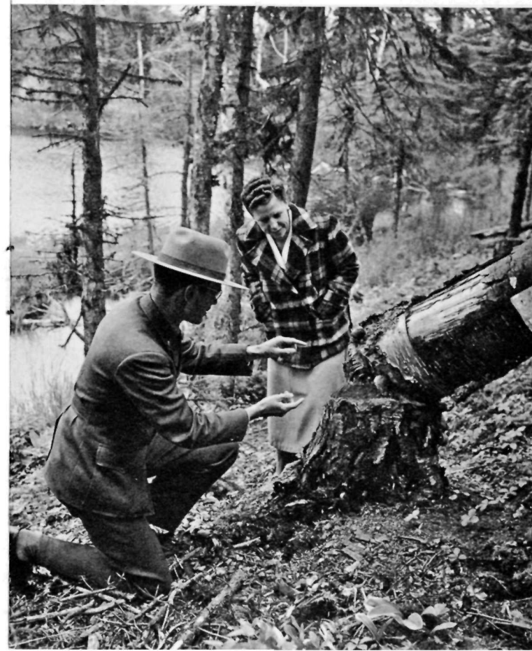
Beavers cut this birch, Ma'am.

sions, Inc., Mammoth Cave, Ky., 42259, in winter; National Park Concessions, Inc., Rock Harbor, Houghton, Mich., 49931, in summer for Rock Harbor Lodge ; National Park Concessions, Inc., Windigo Inn, Isle Royale, via Grand Portage, Minn., 55605, in summer for Windigo Inn .