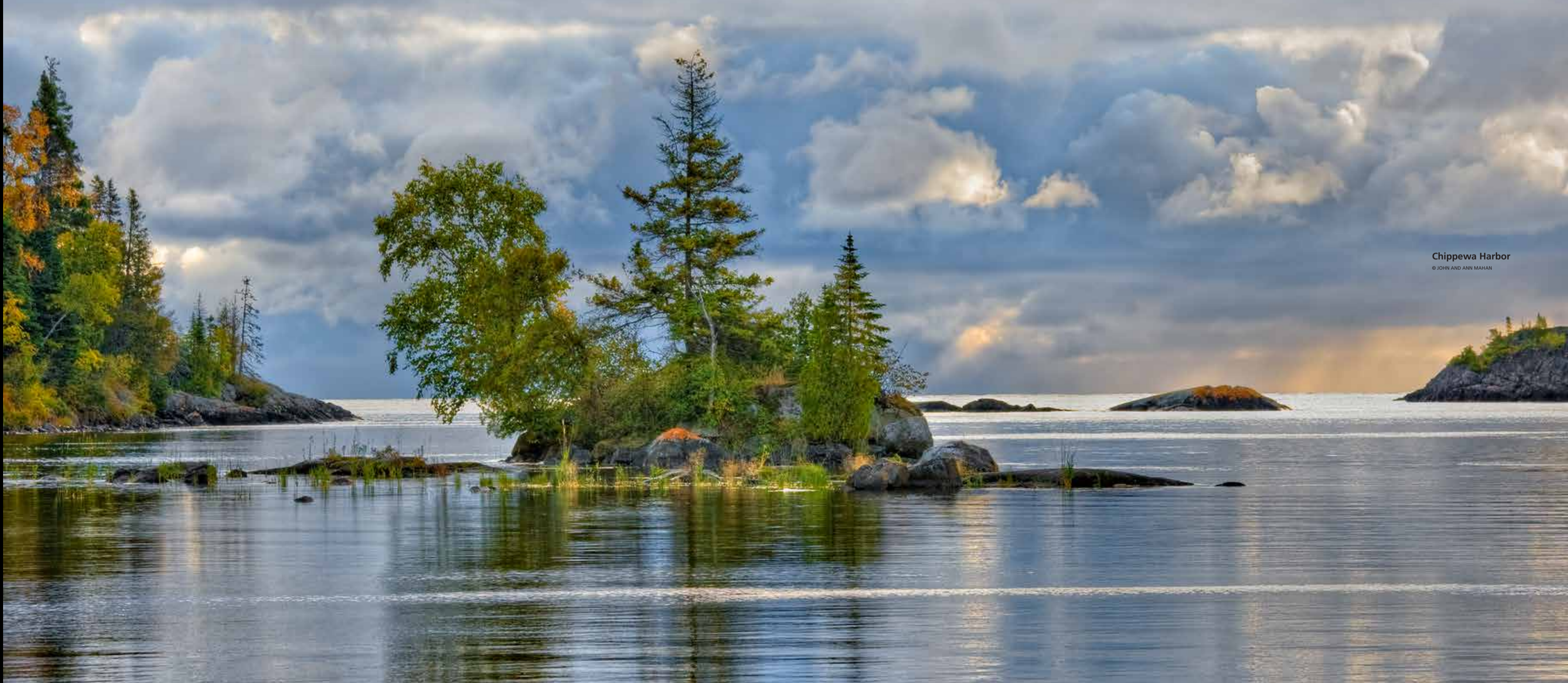
Chippewa Harbor