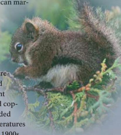
Isle Royale red squirrel

Early human crossings of Lake Superior to Isle Royale presented both risks and rewards. Pre-contact cultures, and later the Ojibwe, harvested copper deposits, an abundant fishery, and other resources. Commercial fishermen and copper miners, lumberjacks, and lighthouse keepers depended upon the island for their livelihood. Cool summer temperatures and wilderness pursuits enticed vacationers in the early 1900s. Today Isle Royale National Park is a designated wilderness and biosphere reserve, attracting hiking, paddling, and backpacking enthusiasts as well as boaters, divers, and others.