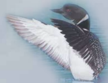
Common loon

This shard of a continent becalmed in the green fresh-water sea is indeed royal, isolate, and supreme.