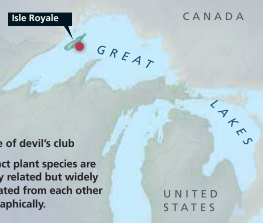
Range of devil's club Disjunct plant species are closely related but widely separated from each other geographically.