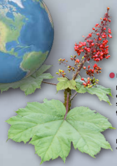
Devil's club