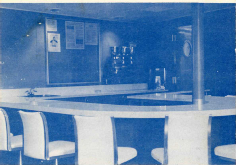
The Snack Bar