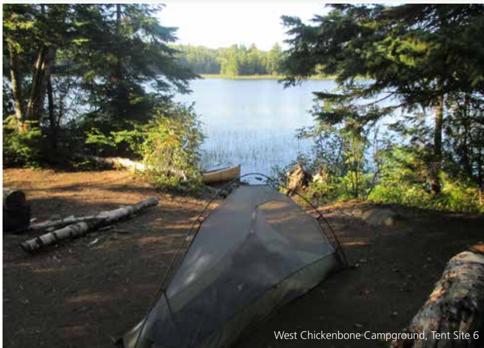
West Chickenbone Campground, Tent Site 6

Boat Rentals are available at Windigo and Rock Harbor. Contact Rock Harbor Lodge for more information (see page 10).