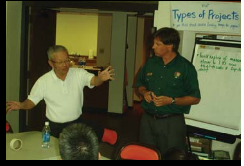
NPS Listening Sessions in Glendale, Arizona and Denver, Colorado