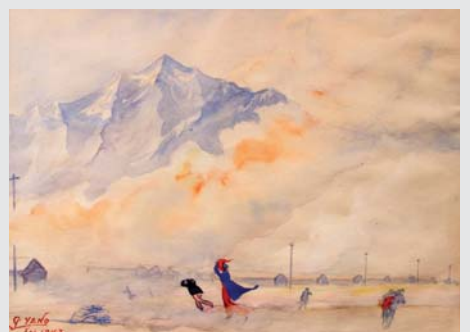
Artwork by George Yano