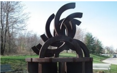
The David Berger National Memorial depicts the Olympic rings broken in half, but motioning upward in hope for the future. The base consists of eleven posts, symbolizing the eleven athletes and coaches who were killed.