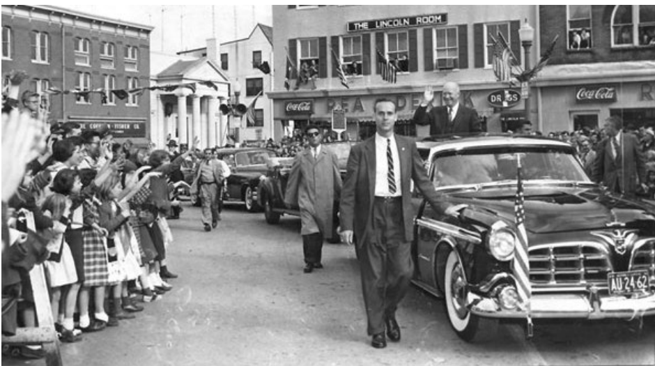
The Secret Service today can always be seen protecting the President and his family. President Eisenhower in this 1955 photo has agents walking with his car.