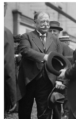
Happy Birthday William Howard Taft! 27 th President and 10 th Chief Justice, William Howard Taft was born on September 15, 1857 in Cincinnati, Ohio.