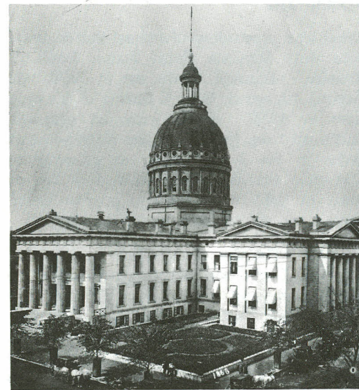
The Old Courthouse in 1868.

discuss relief for victims of the Irish famine, while others at the same time urged the stemming of the wave of immigration caused by the famine. In 1849 Senator Thomas Hart Benton, one of the great political figures and orators of his day, made his "Westward the Course of Empire" speech calling for a railroad to the Pacific linking East and West. Meetings were held in the 1840's and 1850's to consider the slavery issue and the rising tensions between North and South, and, following the assassination of Lincoln, a bust of him was placed on top of an empty tomb in the rotunda to honor the slain President. Towards the end of the century St. Louis did not lack for meeting places, and the Old Courthouse saw fewer large gatherings. One of the last events was a public reception held for President Grover Cleveland in 1887.