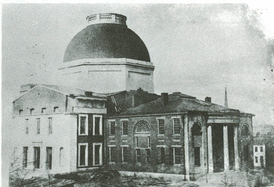
The Old Courthouse as it appeared in its first stage of construction between 1845 and 1851.

The building was begun in 1839 following a plan by Henry Singleton, which called for a Greek revival architectural style. The west wing and the rotunda, which adjoined the old brick courthouse to the east, were officially opened in 1845. Between 1851 and 1862 a new dome, the north and south wings, plus a new east wing, were added under the direction of Robert S. Mitchell. William Rumbold, designer of the iron framework of the new Italianate dome, had to build a scale model and load it with 13,000 pounds of pig iron to convince skeptics of its soundness. This dome was the forerunner of many similar ones to be seen on capitol buildings throughout the land and predates that of the Nation's Capitol by two years.