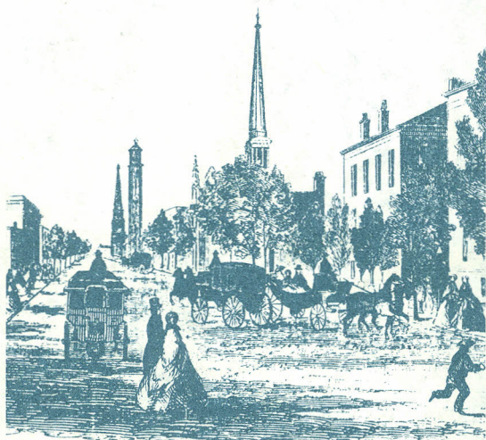
The View in Locust Street

These photographs, both taken in 1868, show the Old Cathedral (left) and the Courthouse in their original settings.