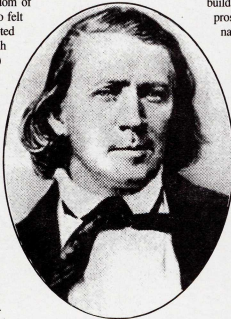
Brigham Young, photographed in 1853

persecution in New York State, Joseph Smith departed for Kirtland with many of his followers. A second colony was established in Jackson County, Missouri, where Smith planned to build a "New Jerusalem." The L.D.S. Church prospered and grew, becoming politically and financially influential.