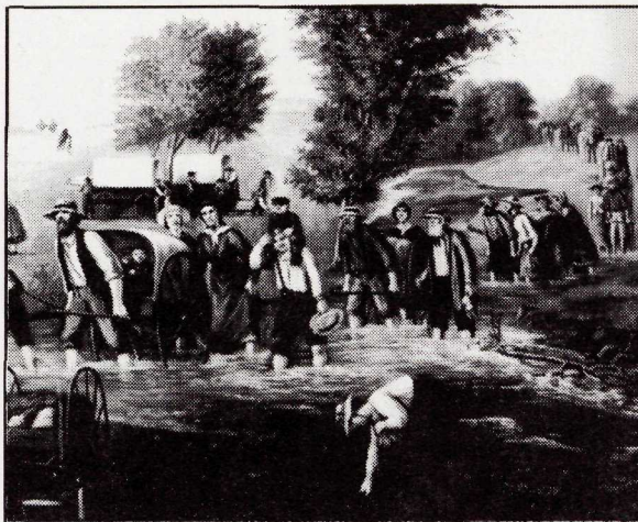
Mormons hauling handcarts across a prairie stream.

The Mormons traveled a long, rough road to reach their "promised land." The overland travels of successive waves of emigrants to Utah constitute one of the epic tales of American history — over 47,000 Mormon pioneers traveled the Mormon Trail between 1847 and 1860 alone. They were the first agricultural colonizers of the intermountain states, and some of the most determined, entrepreneurial, and resourceful settlers of the American West.