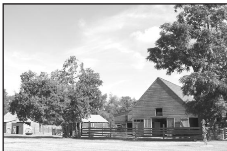
Area around the barn on the Carter farm