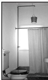
First indoor bathroom contained a shower designed by Earl Carter