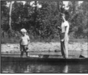
Billy Carter with his older brother, Jimmy, fishing in a pond near Americus, GA