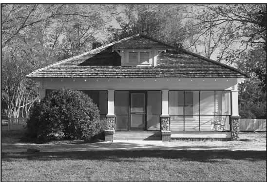
Present day photo of Jimmy Carter's childhood home