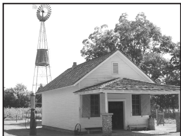
Windmill behind farm store