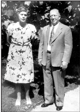
Earl and Lillian Carter