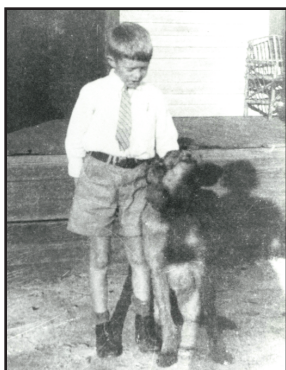
Jimmy, age 8

From the time he was four until he was eighteen, young Jimmy Carter grew up in a rural setting in the community of Archery, approximately 2 miles west of Plains. As the son of an innovative farmer, he worked alongside his father and their sharecroppers growing peanuts, cotton, sugarcane, corn, and other row crops. The Great Depression changed the rural economy and the New Deal initiated programs to combat the economic downturn. Many of those programs were meant to help farmers in conserving their precious topsoil, controlling wildfires, and making their lands more productive. Many farmers abandoned marginal cropland and planted pine trees or allowed them to naturally seed to reforest exhausted land. These conservation measures taught the young farm boy early on that the land will take care of people if they take care of it. Besides the government’s New Deal programs, the influence of the church in teaching the doctrine of stewardship, taking care of God’s gifts, was also a part of Jimmy Carter’s early upbringing. The church, the family, and organizations such as the Future Farmers of America