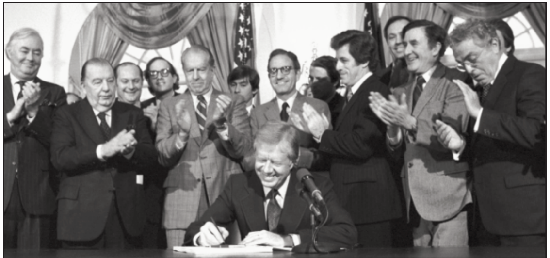
President Carter signs "Super Fund" Legislation - 1980

Recreation time for a governor or president is a rare commodity. Carter spent most of his leisure time outdoors during those years. As governor, Carter took the time to learn to fly-fish for mountain trout. Fly-fishing has become one of his most cherished pastimes. While president, he spent getaway time at Camp David fly-fishing for trout on the compound. Occasionally he and Mrs. Carter would secretly escape the press entourage by taking a short helicopter trip to Spruce Creek in Pennsylvania to catch trout. Another, more celebrated trip was a presidential family vacation in 1978 when the Carters visited Yellowstone National Park and rafted down the Snake River. President Carter chose the natural beauty of Camp David as the most appropriate setting to bring Egypt and Israel together, to negotiate the now famous peace treaty. The Carters cherished their trips back home as well. The Southern forests provided solitude and gave them time to reflect, regenerating them with nature's beauty.