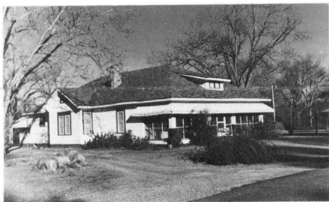
Carter Boyhood Home