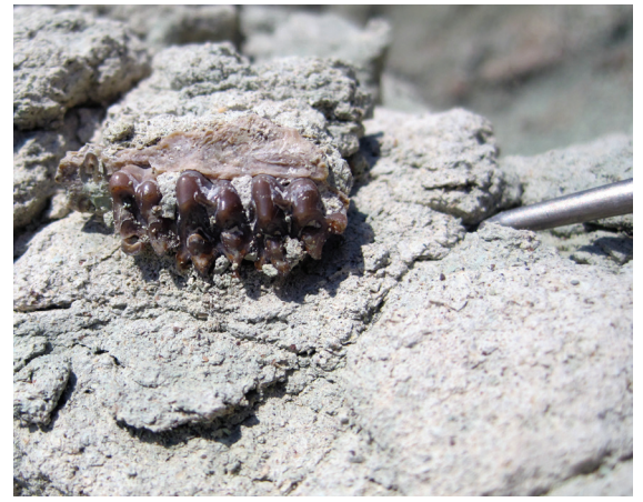
Fossil Jaw Bone of Mouse-Deer with Teeth

The blue-green sedimentary rock entombed evidence of past life such as animal burrows and trackways. Paleontologists have found a remarkable amount of unusual fossils within each of the colorful layers. The ancient ecosystem, rich in animal diversity, included mouse-deer, three-toed horses, tortoises, and tiny limbless lizards that hunted in the leaf litter of