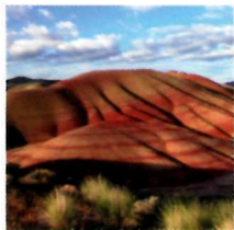
Painted Hills Unit