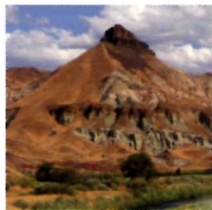
Sheep Rock Unit

Hiking trails are available year-round during daylight hours at all three units.