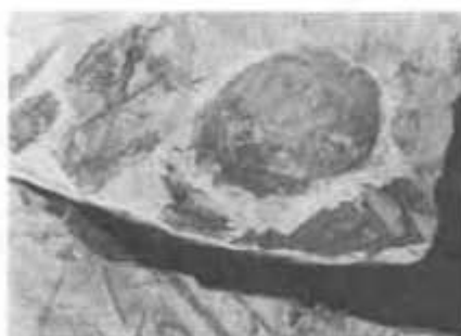
PERSEA PRAELINGUE Sanborn (AVOCADO)

(All specimens approximately one-half natural size)