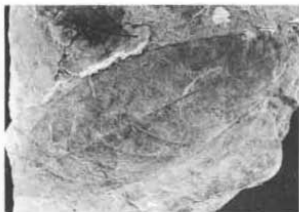
MAGNOLIA LEEI Knowlton (MAGNOLIA)