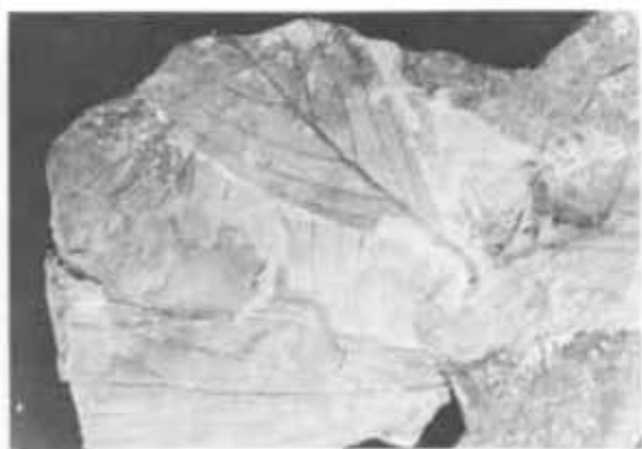
LITSEA OREGONENSIS, new species