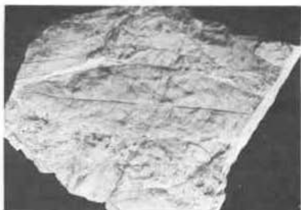
LAUROPHYLLUM MERRILLI Chaney and Sanborn (LAUREL)