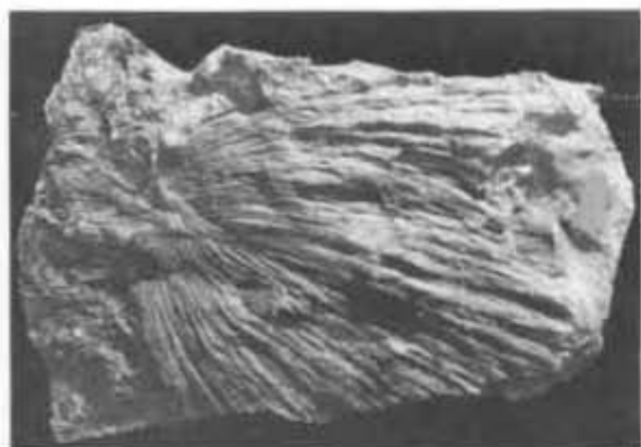
SABALITES EOCENICA (Lesq) Dorf (PALM)