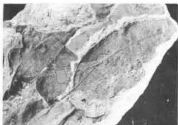
CRYPTOCARYA EOCENICA, new species