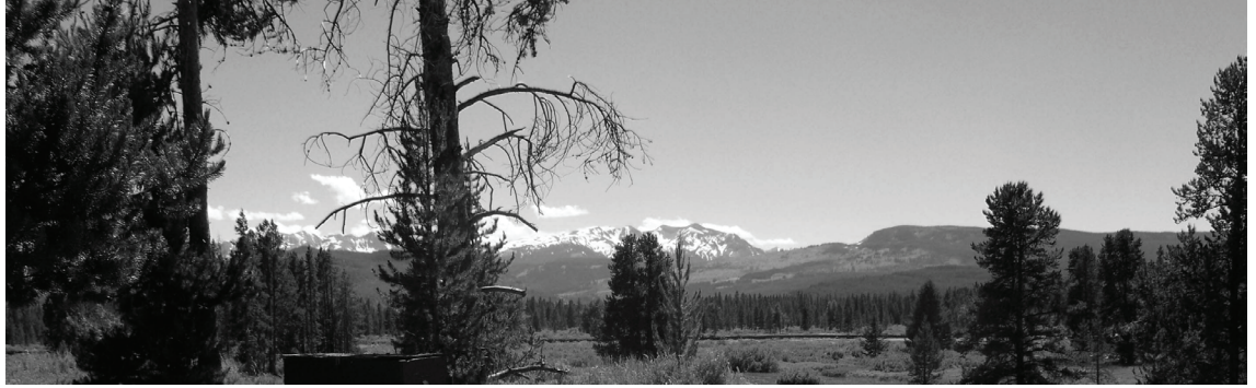
Flagg Ranch Campfire Circle

The John D. Rockefeller, Jr. Memorial Parkway was established in 1972, to commemorate the many significant contributions to conservation made by Rockefeller. The Memorial Parkway provides a symbolic and physical connection between the world's first national park, Yellowstone, and Grand Teton. The John D. Rockefeller, Jr. Memorial Parkway offers a myriad of recreational opportunities on 24,000 acres of parkland. Refer to the map on the reverse side for locations of the following activities.