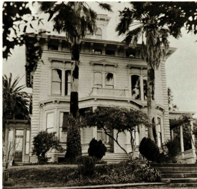
Muir House. Built 1882.

Man must see himself as a child of nature, he thought, with a vast stake in achieving a harmonious relationship with the rest of the natural world.