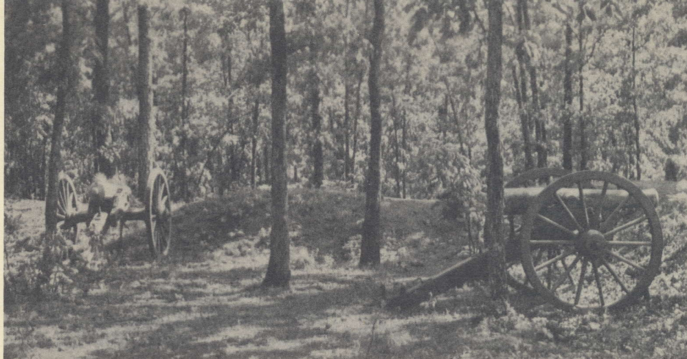
Confederate Fort, Cheatham Hill.

Cumberland was to make one assault at a point in the Confederate center, a hill south of the Marietta-Dallas Road, defended by Gen. B. F. Cheatham, and now known as Cheatham Hill. McPherson's Army of the Tennessee was to assault the Confederate center at the south end of Little Kennesaw Mountain. Both assaults were to be made at the same time, on June 27, so that troops from one part of the Confederate line could not be used to reinforce any other part of the line. The Federal troops bravely assaulted these points, but were repulsed with heavy losses. Sherman lost 2,500 men and Johnston 800 in this final phase of the battle.